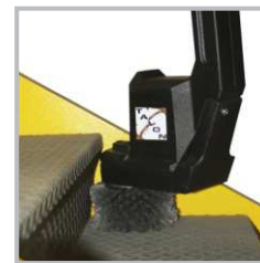
Talon Scrubs in Tight Spaces