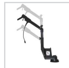
Adjustable Handle Height Locks to Position