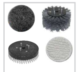
Talon Tools Strip, Scrub & Polish