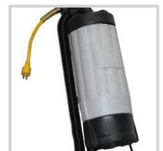
Includes Handle Mounted 6 Quart Tank Vacuum