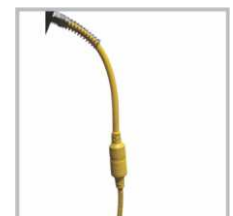
Two-Piece Twist Lock 100 ft. Power Cord