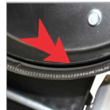
360 Degree Duct in Brush Apron Directs Debris to Vacuum Port