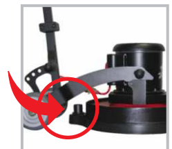
Optional Dust Control Ring Connects to Tank Vacuum