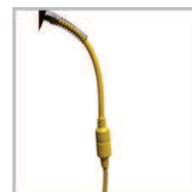
50 ft. Twist-Lock Power Cord