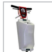
Optional 4 Gallon Solution Tank