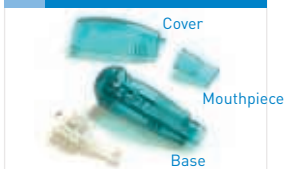
Rocker assembly (Do not disassemble)