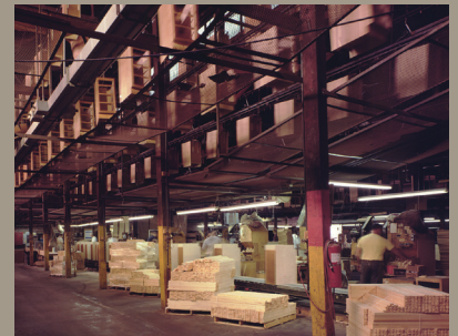
One of America's most efficient kitchen cabinet manufacturing facilities.