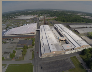
750,000 square feet of manufacturing and finished goods inventory.