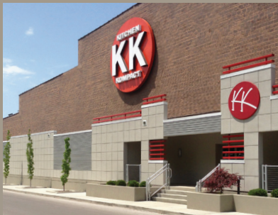
Kitchen Kompact is located in Jeffersonville, Indiana, across the Ohio River from Louisville, Kentucky.