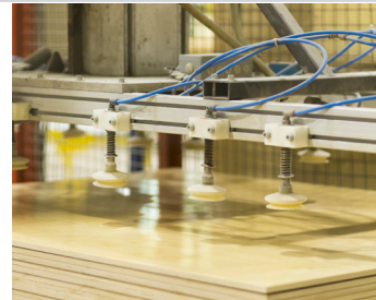
UV- Finishing Line