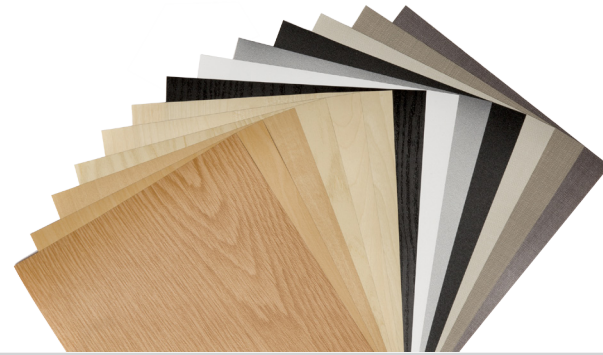
BHK DuraWrap® Color Range