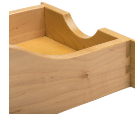
Front Scoop & Side Scallop