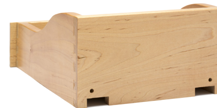
Notching & Boring