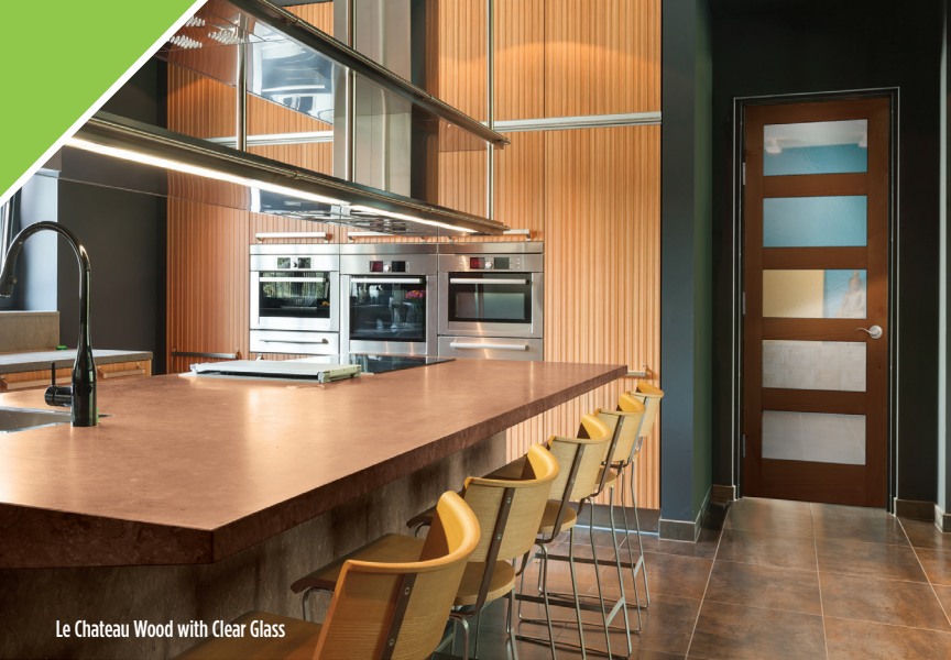
Le Chateau Wood with Clear Glass