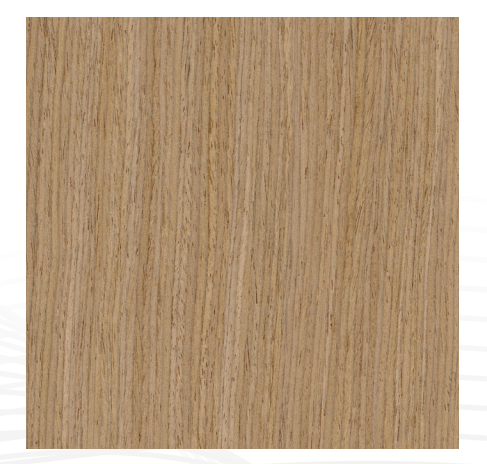
Qtr. Champagne Champ-2Q