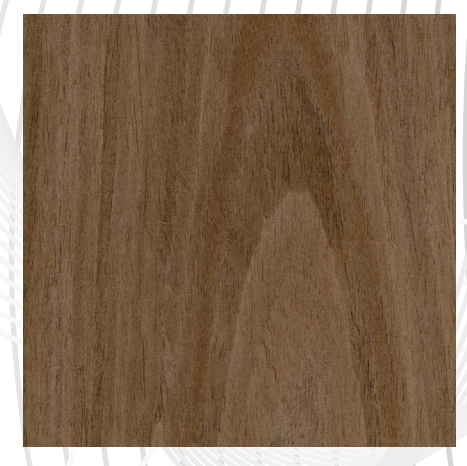
PS Walnut WT-3160C