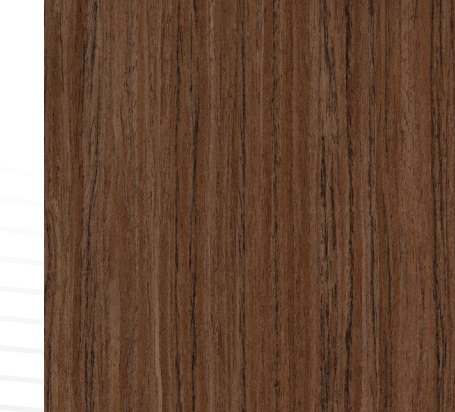
Qtr. Teak TK-016S