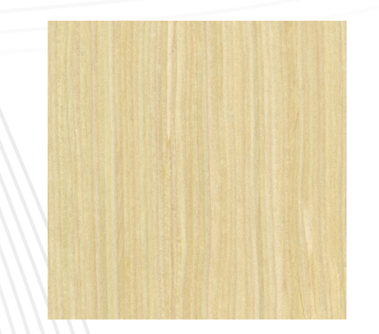
Qtr. Maple MP-168S