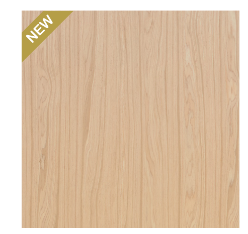
Desert Acacia GL-8833N