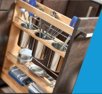
Cabinet Accessory Guide