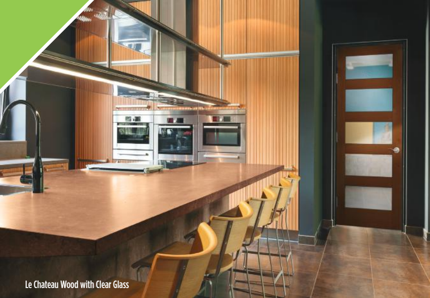
Le Chateau Wood with Clear Glass