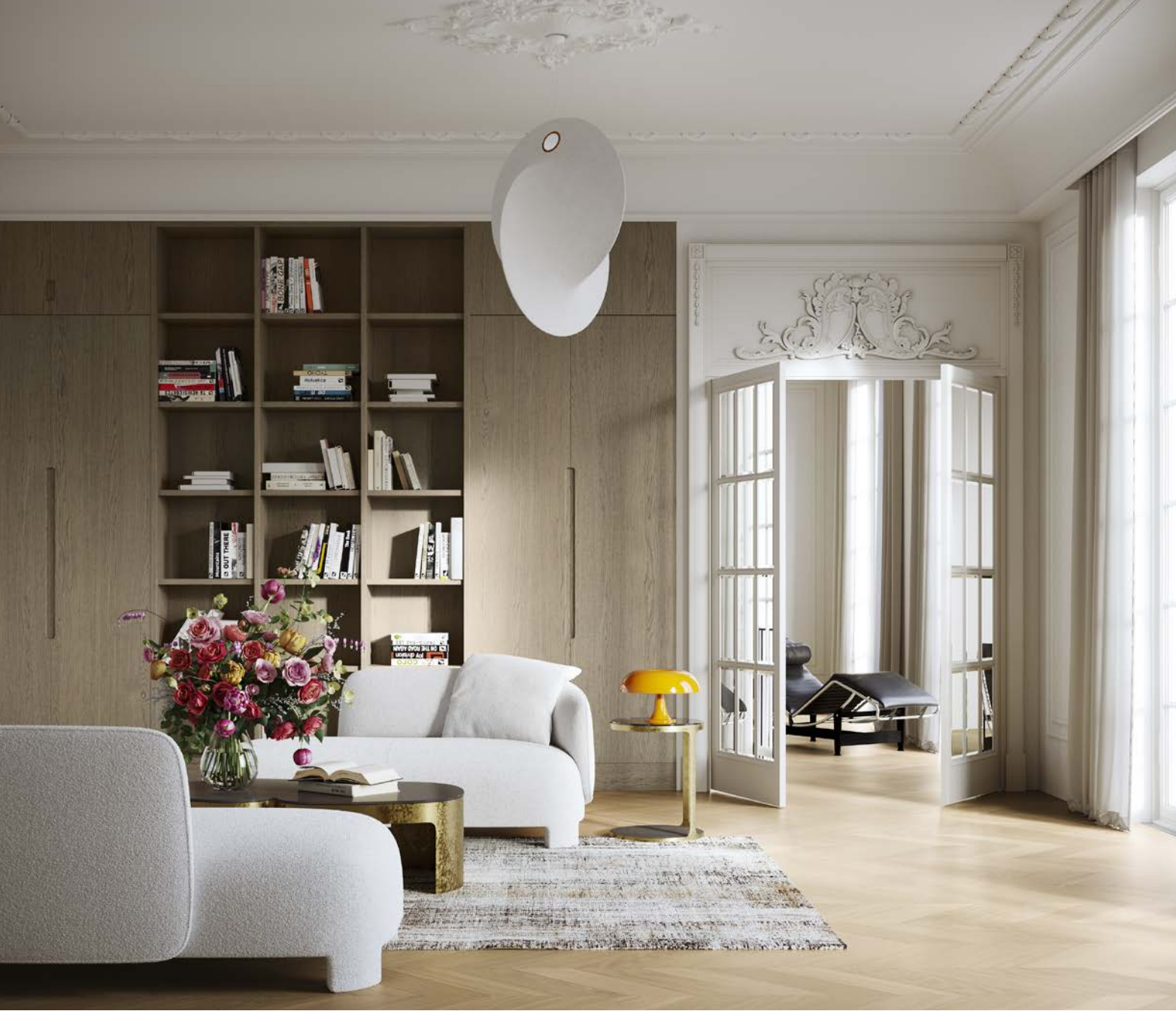
Floor: Parky Swing European Oak