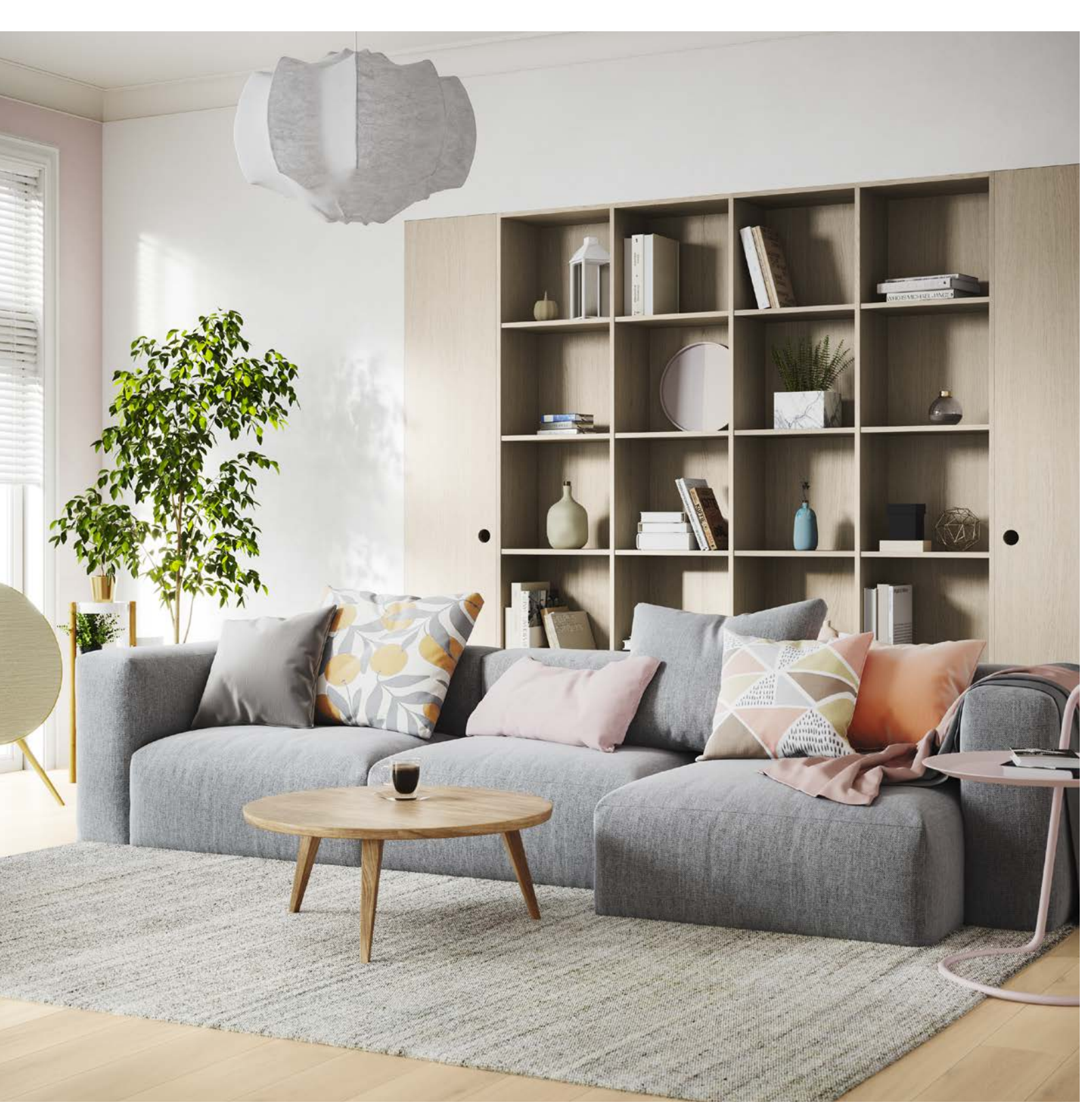
Floor: Parky Deluxe+ Ivory Oak Premium