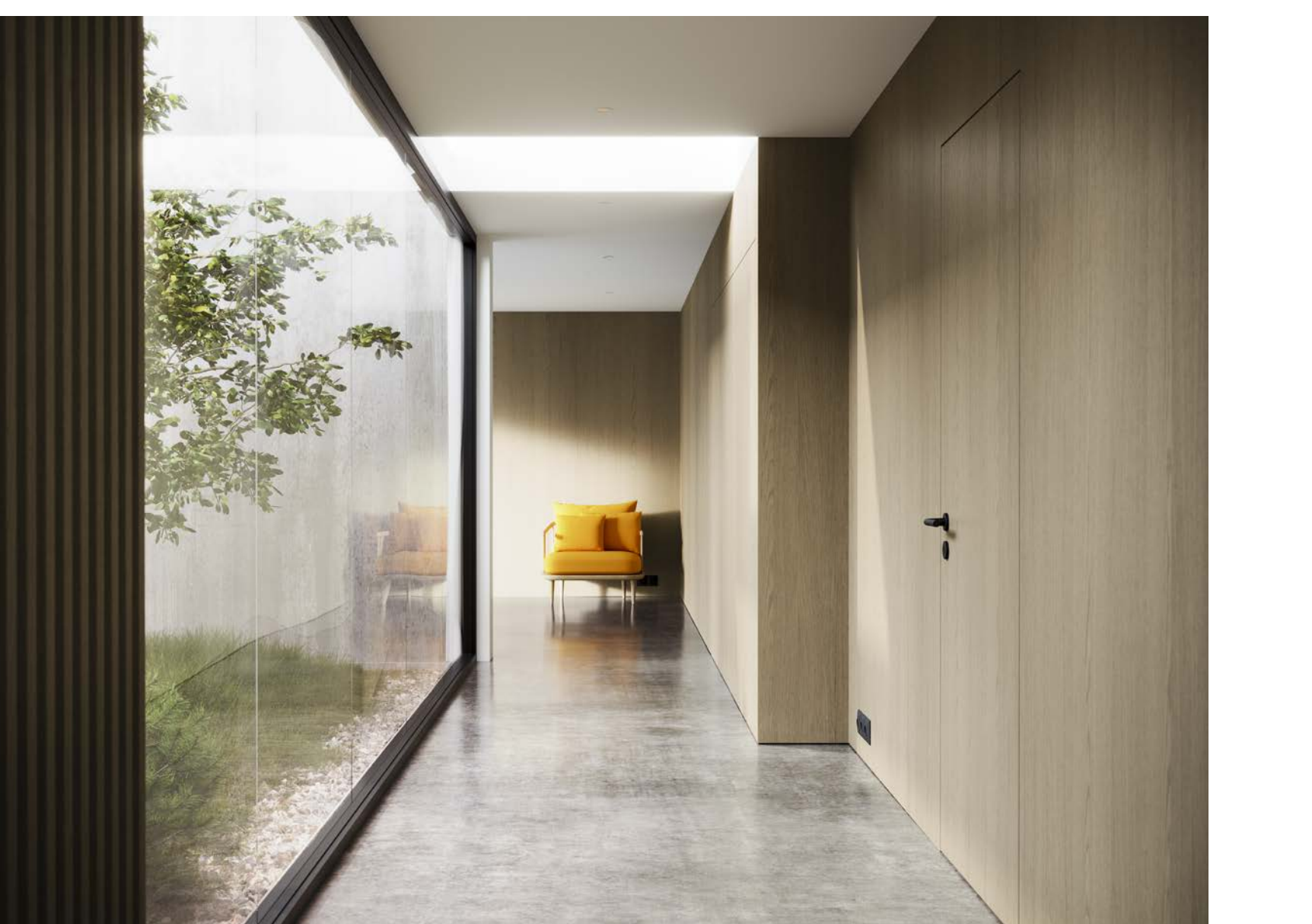
Slats: Astrata Slats Desert Oak