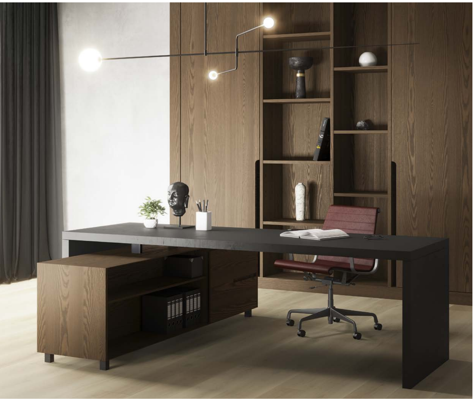
Floor: The Twelve Florence