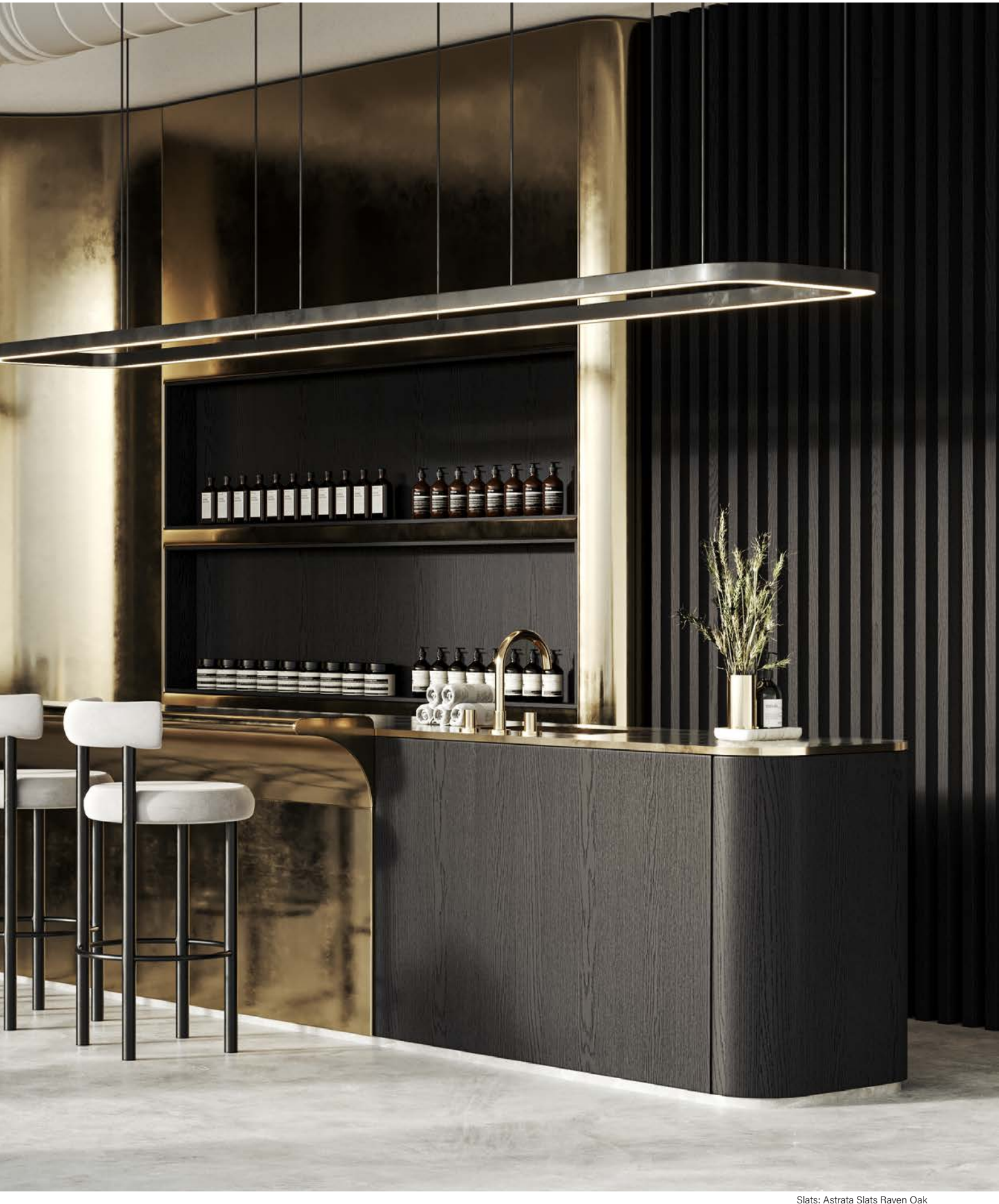
Slats: Astrata Slats Raven Oak