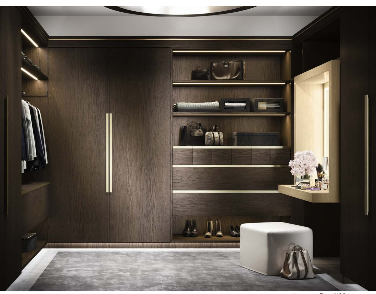
Make up corner: Shinnoki Milk Oak