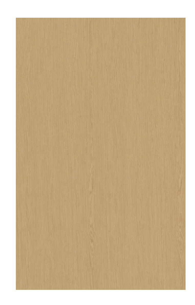
IVORY INFINITE OAK