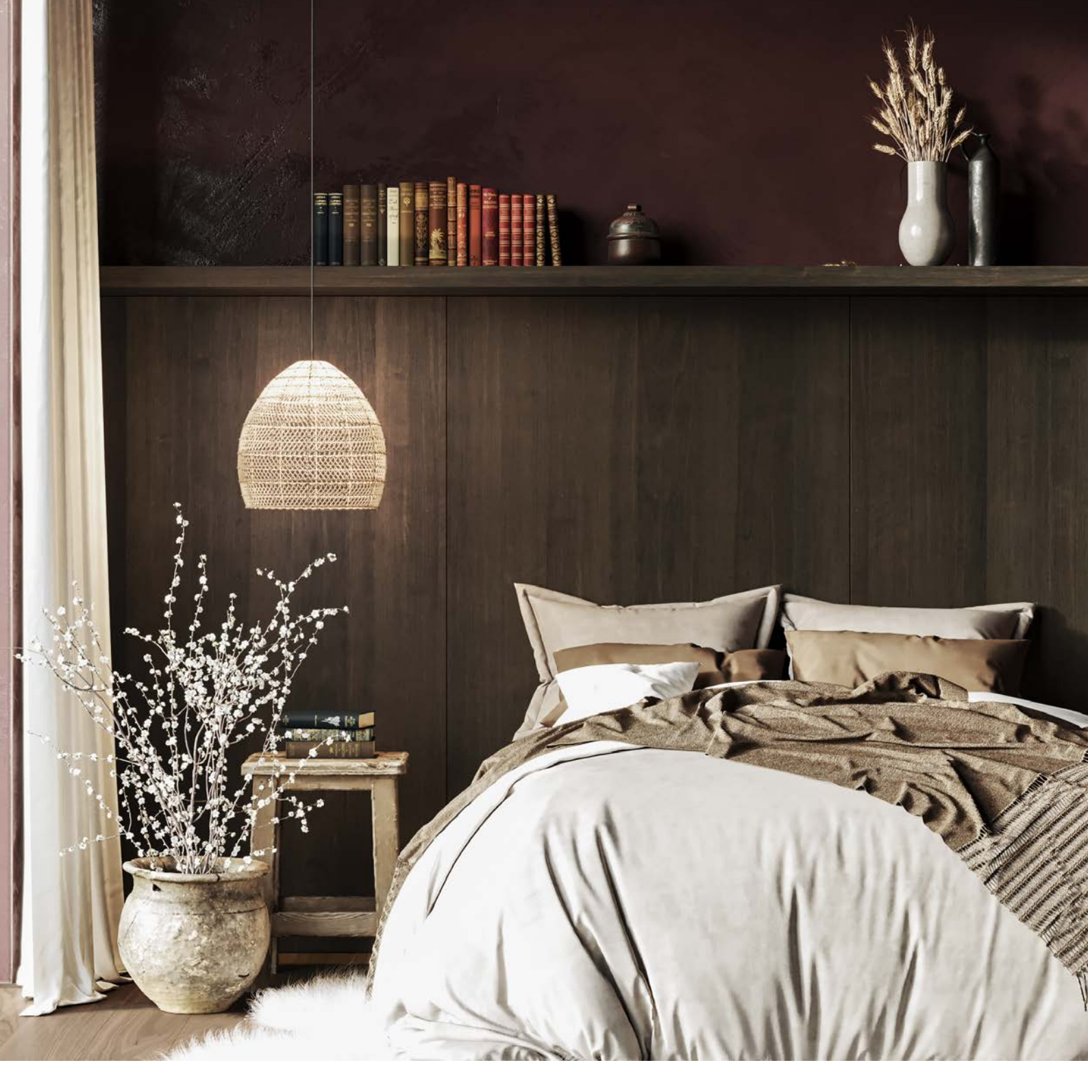
Floor: Parky Summit Frozen Walnut