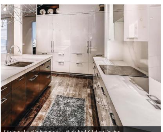
Kitchens by Wedgewood — High-End Kitchen Design