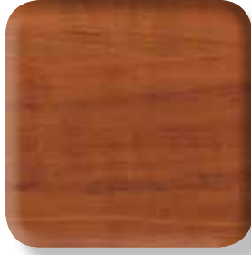
665 - Wild Apple