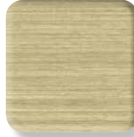
835 - Sand Shoal ◆