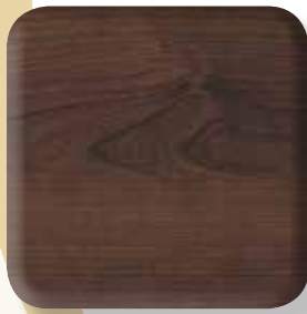
706 - Chocolate Cherry