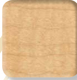
477 - Fusion Maple ●

Colors and patterns shown are printed reproductions and may differ slightly from the actual product. Roseburg recommends viewing actual samples. ■ = Dillard, OR and Missoula, MT. ● = Simsboro, LA. ♦ = Available in Cambium texture.