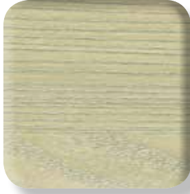
834 - Calm Horizon ◆