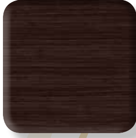
752 - Tierra Linea ◆