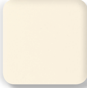
109 - Antique White