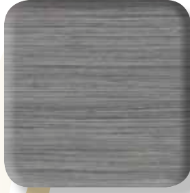
751 - Twilight Linea ◆