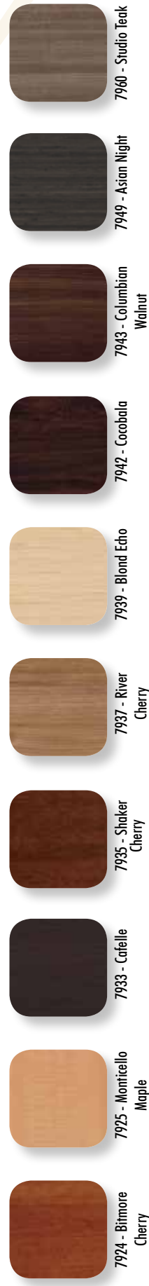
7924 - Bitmore Cherry