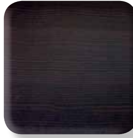
391 - Cordoba Pine