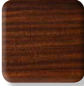
754 - Auburn Mahogany