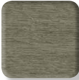
833 - Ruby Beach ◆