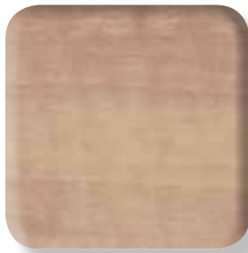
661 - Caramel Apple