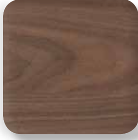
701 - American Black Walnut ■