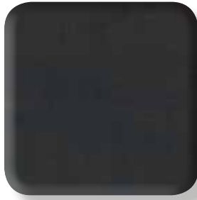
663 - Chocolate Apple