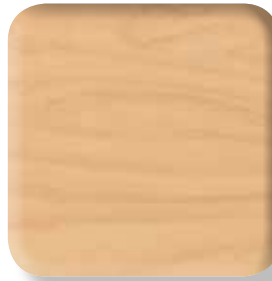
352 - Cabinet Maple