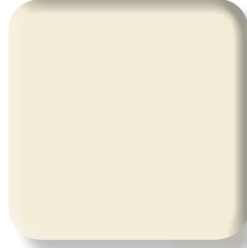
16 - Almond