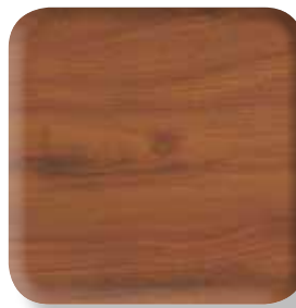
78 - Windsor Mahogany