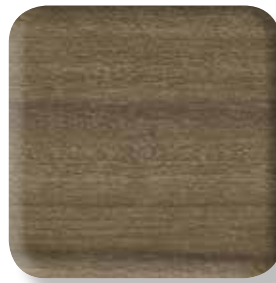
832 - Southern Cattails ◆