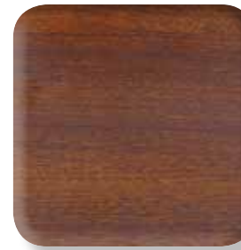
318 - June Mahogany