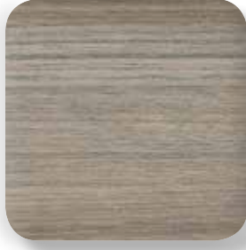
705 - Tuscan Teak Grigio