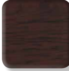
404 - Mahogany Impressions ●