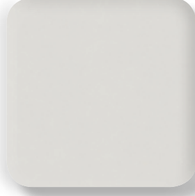
108 - Folkstone