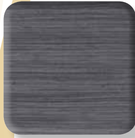
750 - Evening Linea ◆