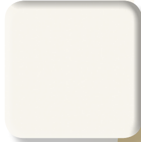
11 - White ♦