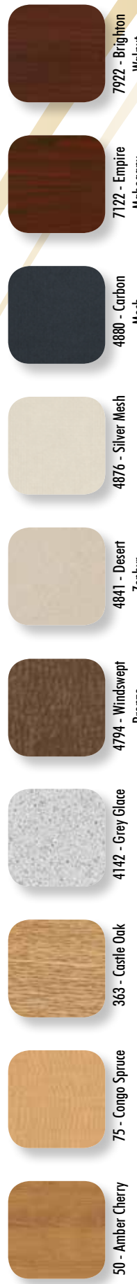
50 - Amber Cherry

Over 150 thermally fused laminate overlays available from Arcclin – “The Right Designs Available Right Now”. Some minimums may apply.