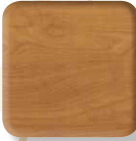
51 - Wild Cherry