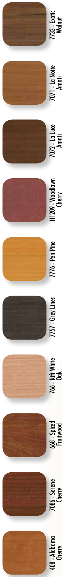
408 - Alabama Cherry