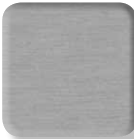
514 - Silver Frost ■