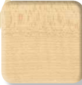
04 - Natural Maple ■