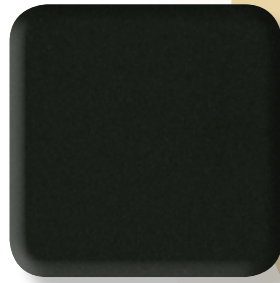
06 - Black ♦