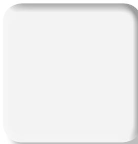
120 - Glacier White ●