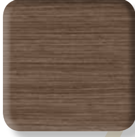
753 - Acorn Linea ◆