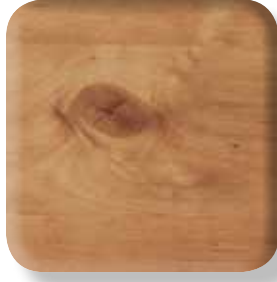
700 - Rustic Alder ■