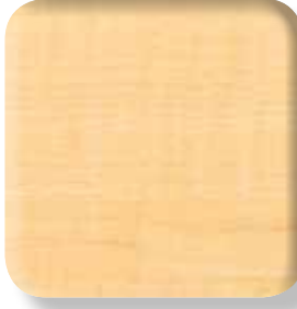
55 - Hard Rock Maple