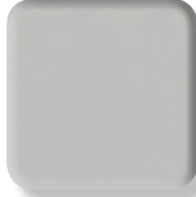
22 - London Grey