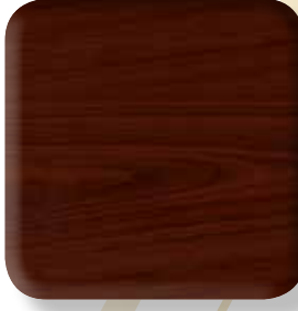
54 - African Mahogany