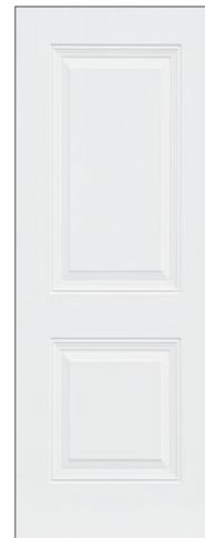
2-PANEL HD Shown in Trukote