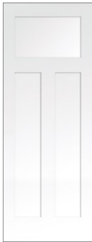
SMOOTH 3-PANEL SHAKER