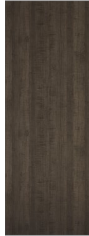
FLUSH Shown in Trugrain Rockport