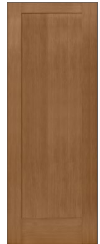
FIR 1-PANEL SHAKER