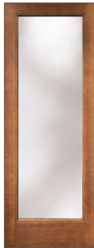
FIR DIRECT GLAZED 1-LITE