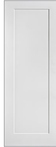
1-PANEL SHAKER Shown in Cambridge