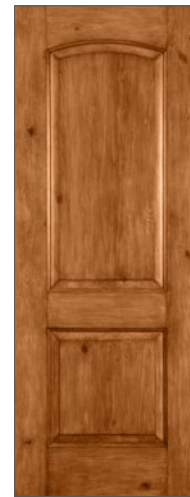
KNOTTY ALDER 2-PANEL ARCH TOP