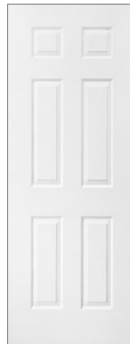
6-PANEL STD Shown in Trukote