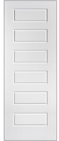
6-PANEL HORIZONTAL Shown in Cambridge