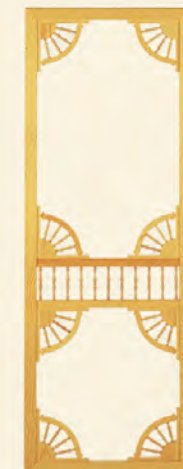
Victorian III Grille