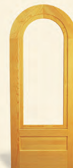
#50 Circle Top