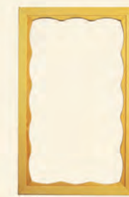
Design "A" Grille