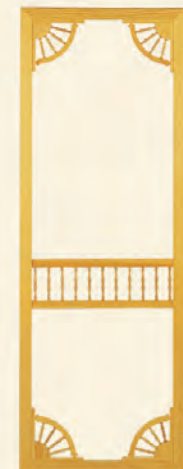
Victorian II Grille