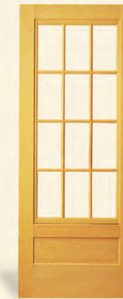
Traditional #11 T.D.L. Glass Insert