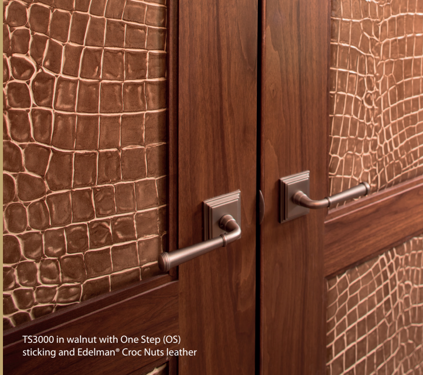
TS3000 in walnut with One Step (OS) sticking and Edelman® Croc Nuts leather