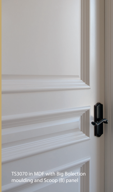
TS3070 in MDF with Big Bolection moulding and Scoop (B) panel