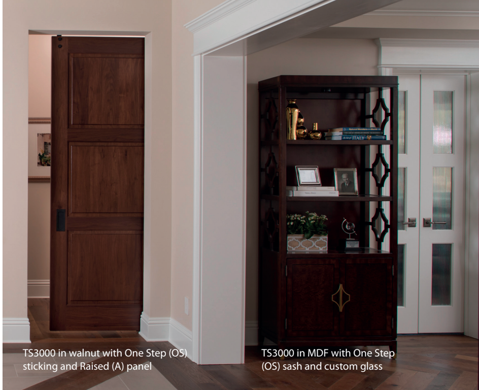
TS3000 in walnut with One Step (OS) sticking and Raised (A) panel