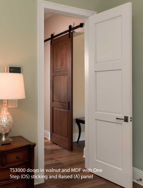
TS3000 doors in walnut and MDF with One Step (OS) sticking and Raised (A) panel