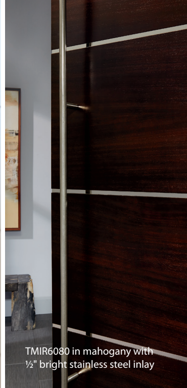
TMIR6080 in mahogany with 1/2" bright stainless steel inlay