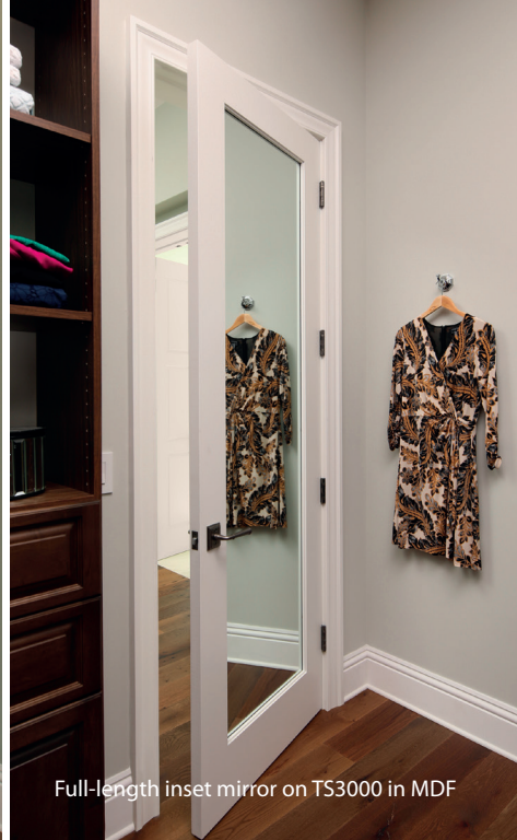
Full-length inset mirror on TS3000 in MDF