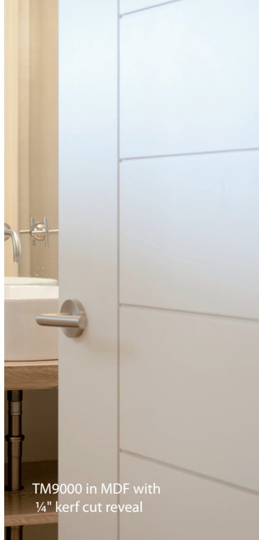
TM9000 in MDF with 1/4" kerf cut reveal