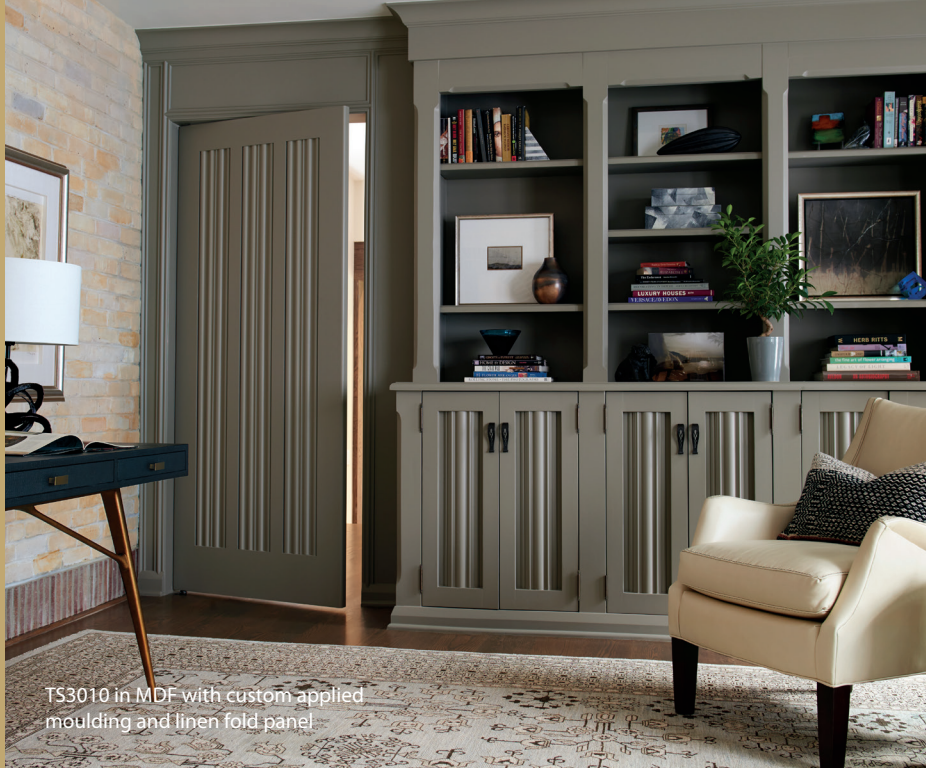
TS3010 in MDF with custom applied moulding and linen fold panel