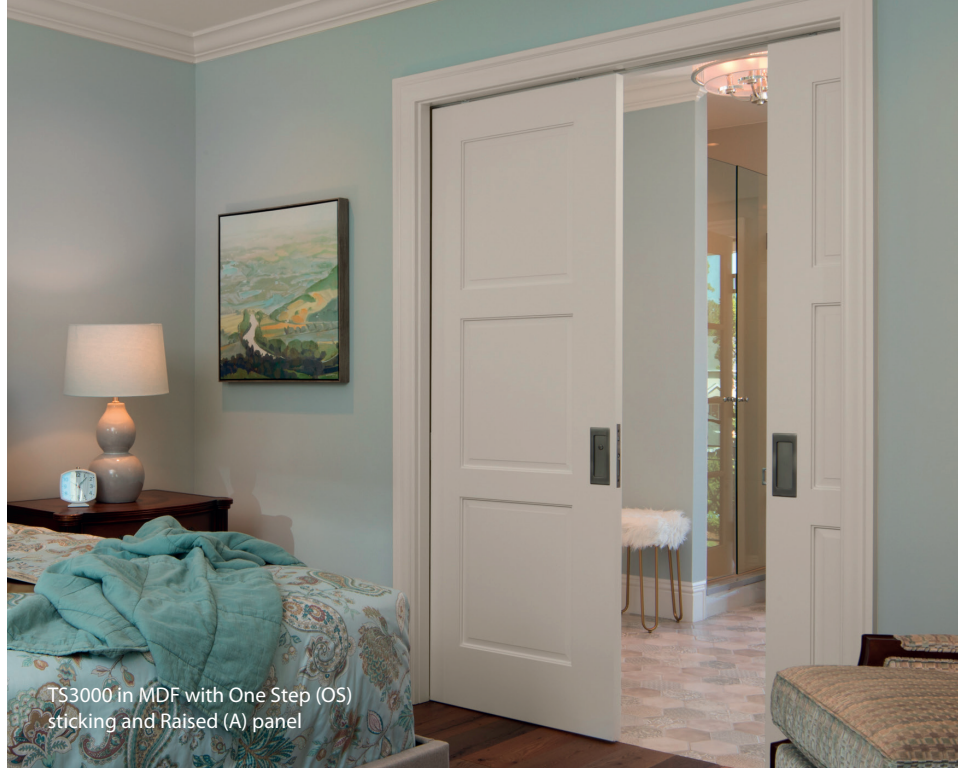
TS3000 in MDF with One Step (OS) sticking and Raised (A) panel

When every opening is designed to fit your exact specifications, we call it a TruStile Design Package. Take advantage of TruStile's flexibility and endless options to create your Design Package today.