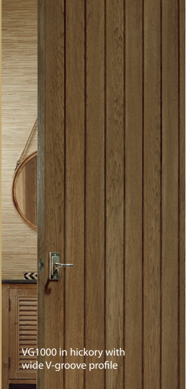
VG1000 in hickory with wide V-groove profile