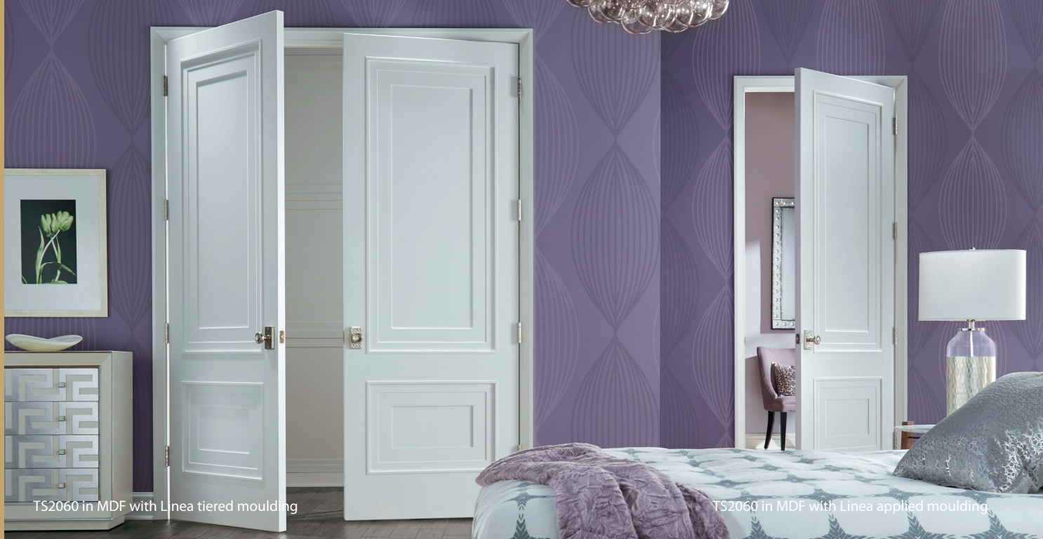
TS2060 in MDF with Linea tiered moulding