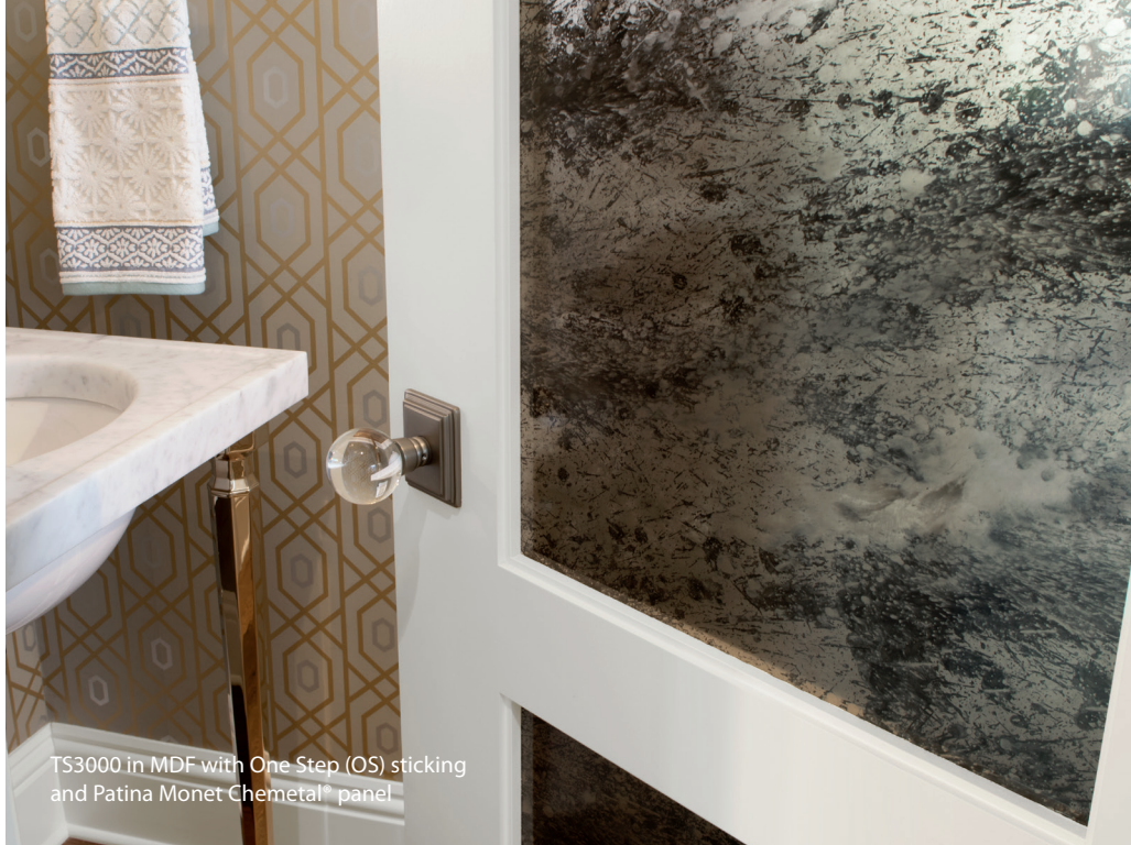
TS3000 in MDF with One Step (OS) sticking and Patina Monet Chemetal® panel

Luxury is at its peak when Edelman® leather and Chemetal® inserts are used as panel substitutions. Their rich details add a level of sophistication that make doors truly stand out.