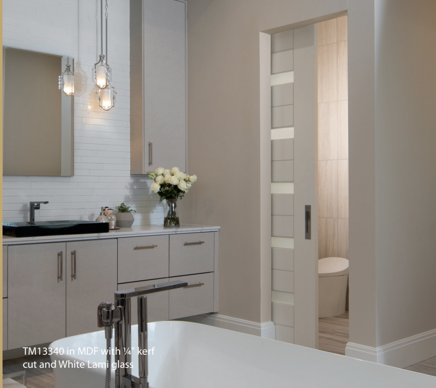
TM13340 in MDF with 1/4" kerf cut and White Lami glass