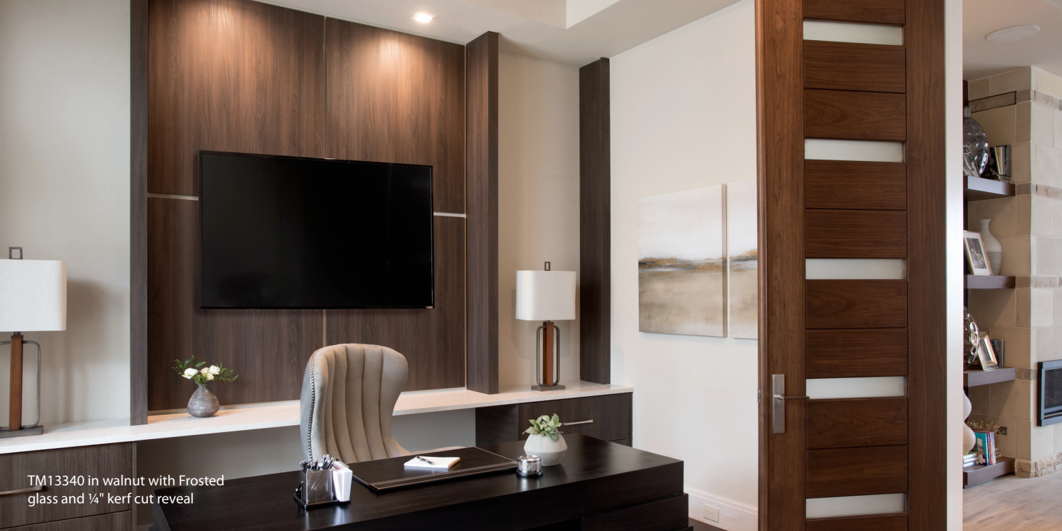
TM13340 in walnut with Frosted glass and ¼" kerf cut reveal