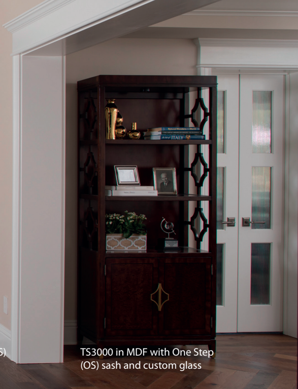
TS3000 in MDF with One Step (OS) sash and custom glass