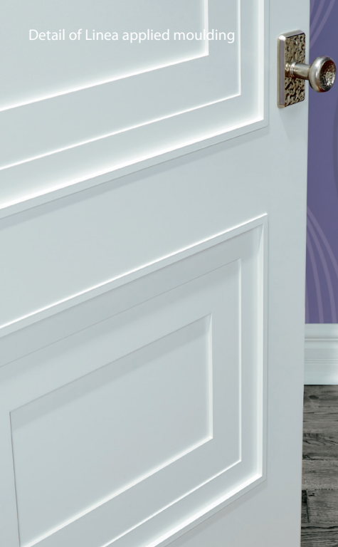
Detail of Linea applied moulding