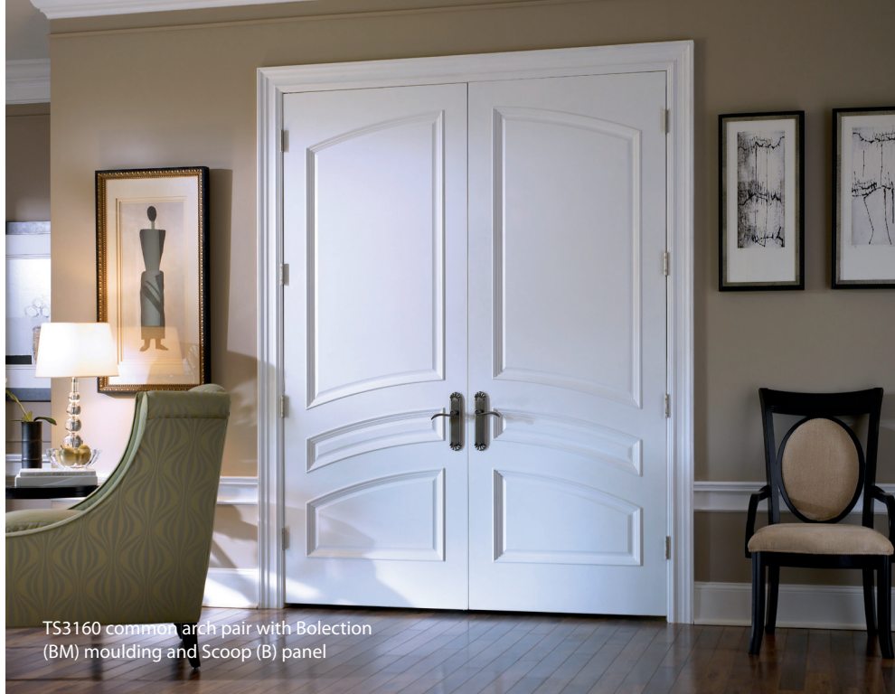
TS3160 common arch pair with Bolection (BM) moulding and Scoop (B) panel

Rather than placing two matching doors side by side, common arch pairs carry details across both doors creating a designed-in look.