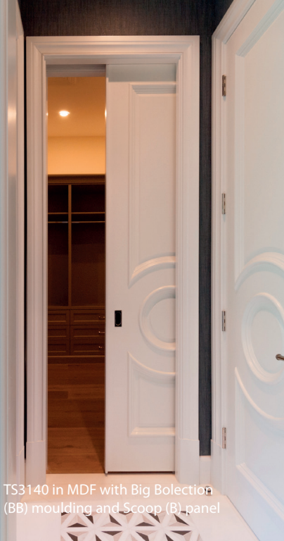
TS3140 in MDF with Big Bolection (BB) moulding and Scoop (S) panel