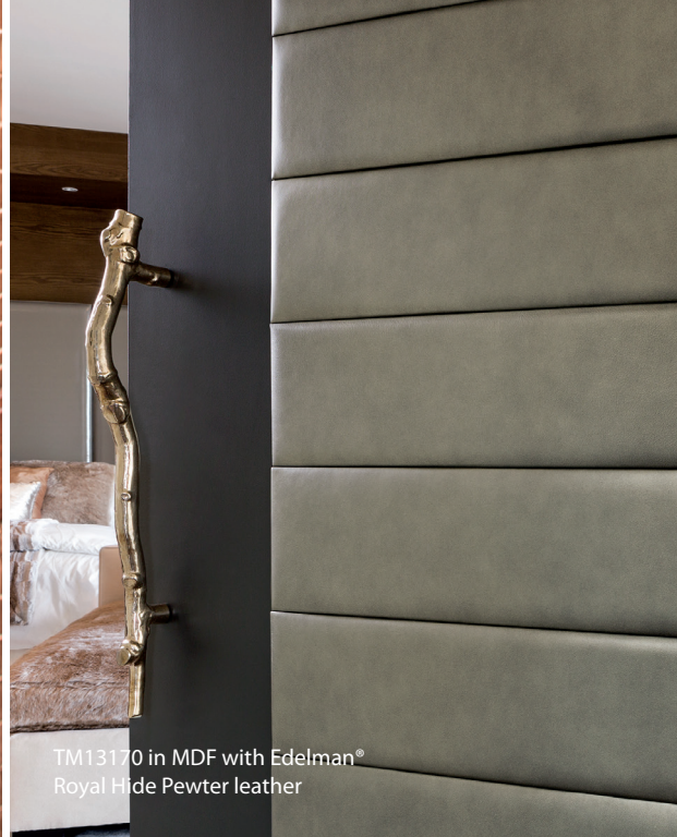
TM13170 in MDF with Edelman® Royal Hide Pewter leather