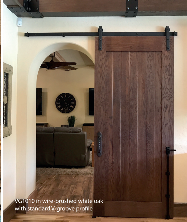
VG1010 in wire-brushed white oak with standard V-groove profile