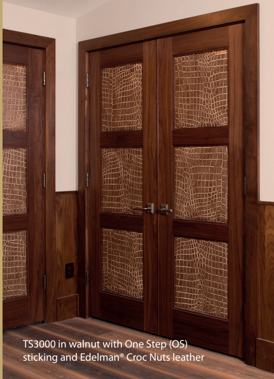
TS3000 in walnut with One Step (OS) sticking and Edelman® Croc Nuts leather