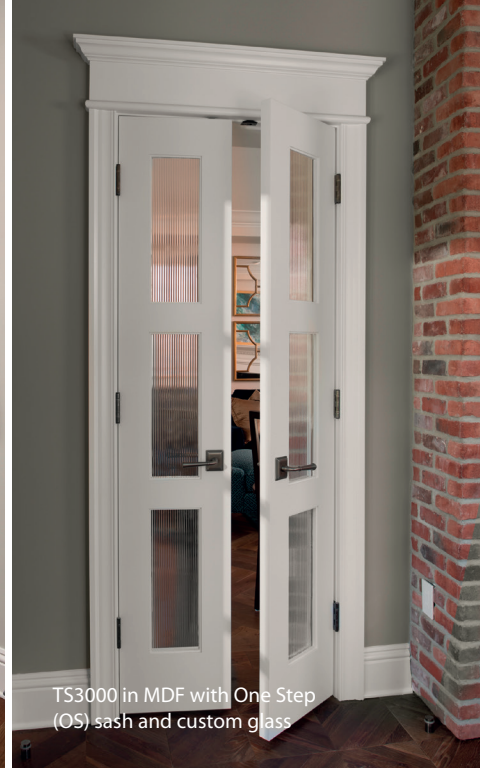
TS3000 in MDF with One Step (OS) sash and custom glass