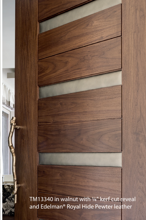
TM13340 in walnut with 1/4" kerf cut reveal and Edelman® Royal Hide Pewter leather