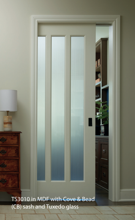
TS3010 in MDF with Cove & Bead (CB) sash and Tuxedo glass