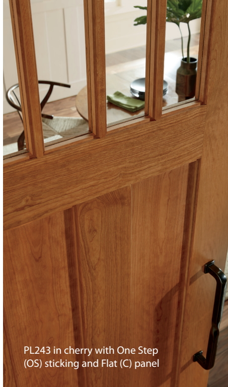
PL243 in cherry with One Step (OS) sticking and Flat (C) panel