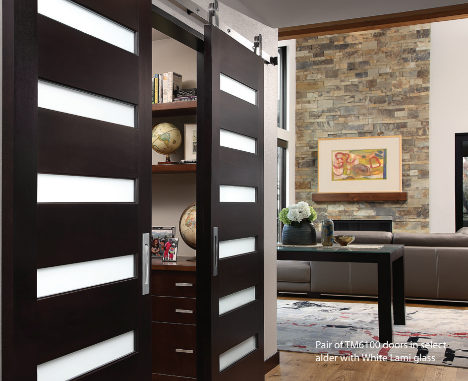
Pair of TM6100 doors in select alder with White Lami glass