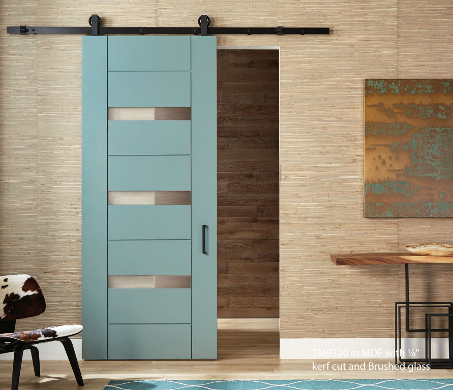
TM9320 in MDF with 1/4" kerf cut and Brushed glass