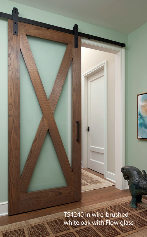
TS4240 in wire-brushed white oak with Flow glass