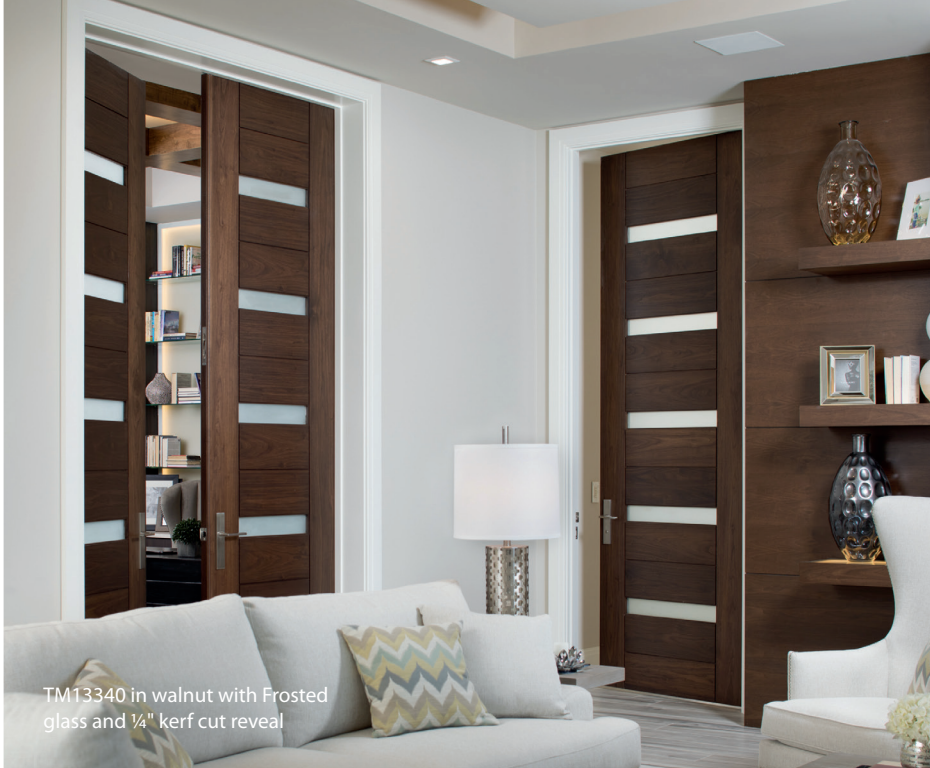
TM13340 in walnut with Frosted glass and 1/4" kerf cut reveal

At TruStile, we believe that every opening is an opportunity to enhance your home's design. Our commitment is to provide today's architects, designers, custom home builders and homeowners with interior doors that support the needs of today's custom projects. Over the next several pages we will walk you through the steps to elevate your next project using interior doors.