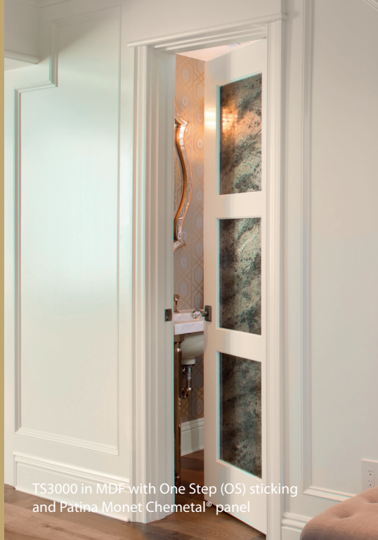
TS3000 in MDF with One Step (OS) sticking and Patina Monet Chemetal® panel