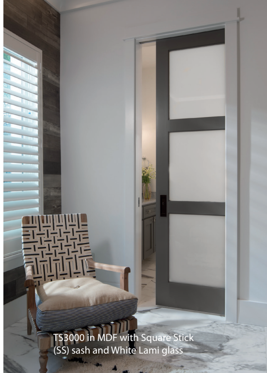
TS3000 in MDF with Square Stick (SS) sash and White Lami glass

Like furnishings and décor, doors should complement your home's architecture. TruStile has the flexibility to tailor your doors to work in a variety of applications.