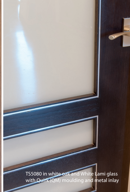
TS5080 in white oak and White Lami glass with Quirk (QM) moulding and metal inlay