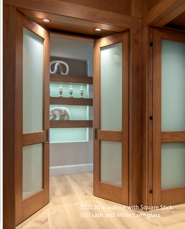
TS2020 in walnut with Square Stick (SS) sash and White Lami glass