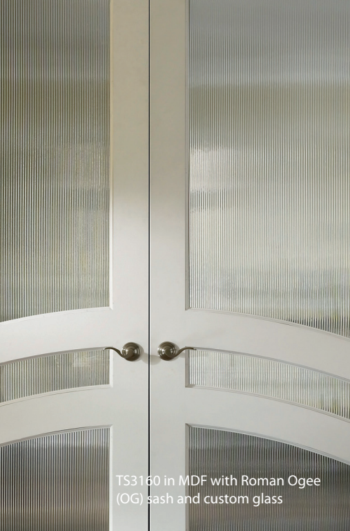
TS3160 in MDF with Roman Ogee (OG) sash and custom glass