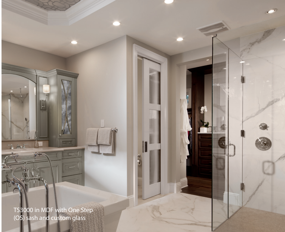
TS3000 in MDF with One Step (OS) sash and custom glass