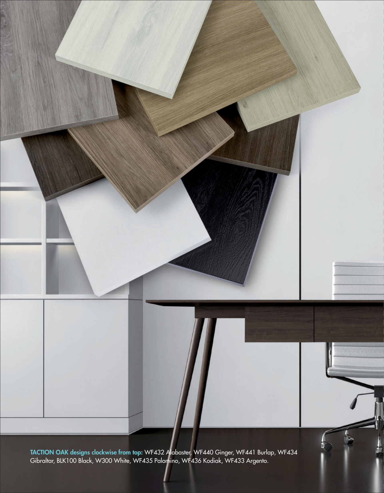
TACTION OAK designs clockwise from top: WF432 Alabaster, WF440 Ginger, WF441 Burlap, WF434 Gibraltar, BLK100 Black, W300 White, WF435 Palomino, WF436 Kodiak, WF433 Argento.