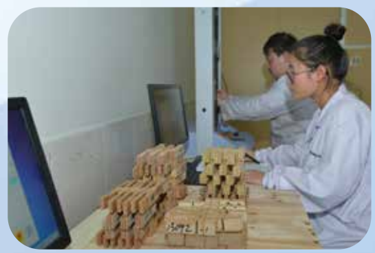
Finished Product Testing and Inspection