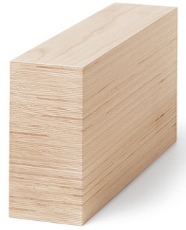
Beam BauBuche GL75

BauBuche GL75 is made from parallel-laminated 40 mm BauBuche S strips. Thanks to its exceptional strength, BauBuche GL75 is the ideal material for slender and elegant constructions and wide spans combined with high loads. The sides of the BauBuche GL75 elements show the attractive veneer pattern, with a plain hardwood finish at the top and the bottom. BauBuche beams are sanded at the factory and therefore ideal for exposed constructions.