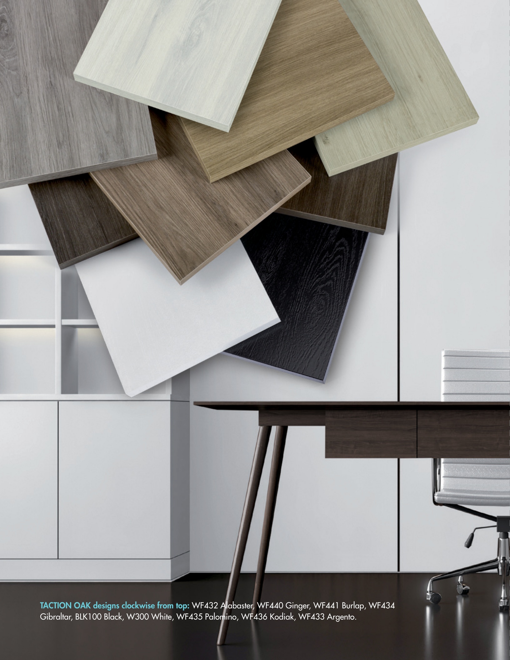
TACTION OAK designs clockwise from top: WF432 Alabaster, WF440 Ginger, WF441 Burlap, WF434 Gibraltar, BLK100 Black, W300 White, WF435 Palomino, WF436 Kodiak, WF433 Argento.