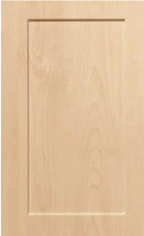
Rigid Thermo Foil

From traditional to transitional interiors, the classic shaker door is timeless. The versatility of the profile blend traditional design with a contemporary edge.