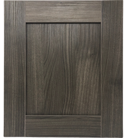
TFL five piece shaker

The traditional shaker door consists of five pieces – 2 ½” rails and stiles and a center panel.