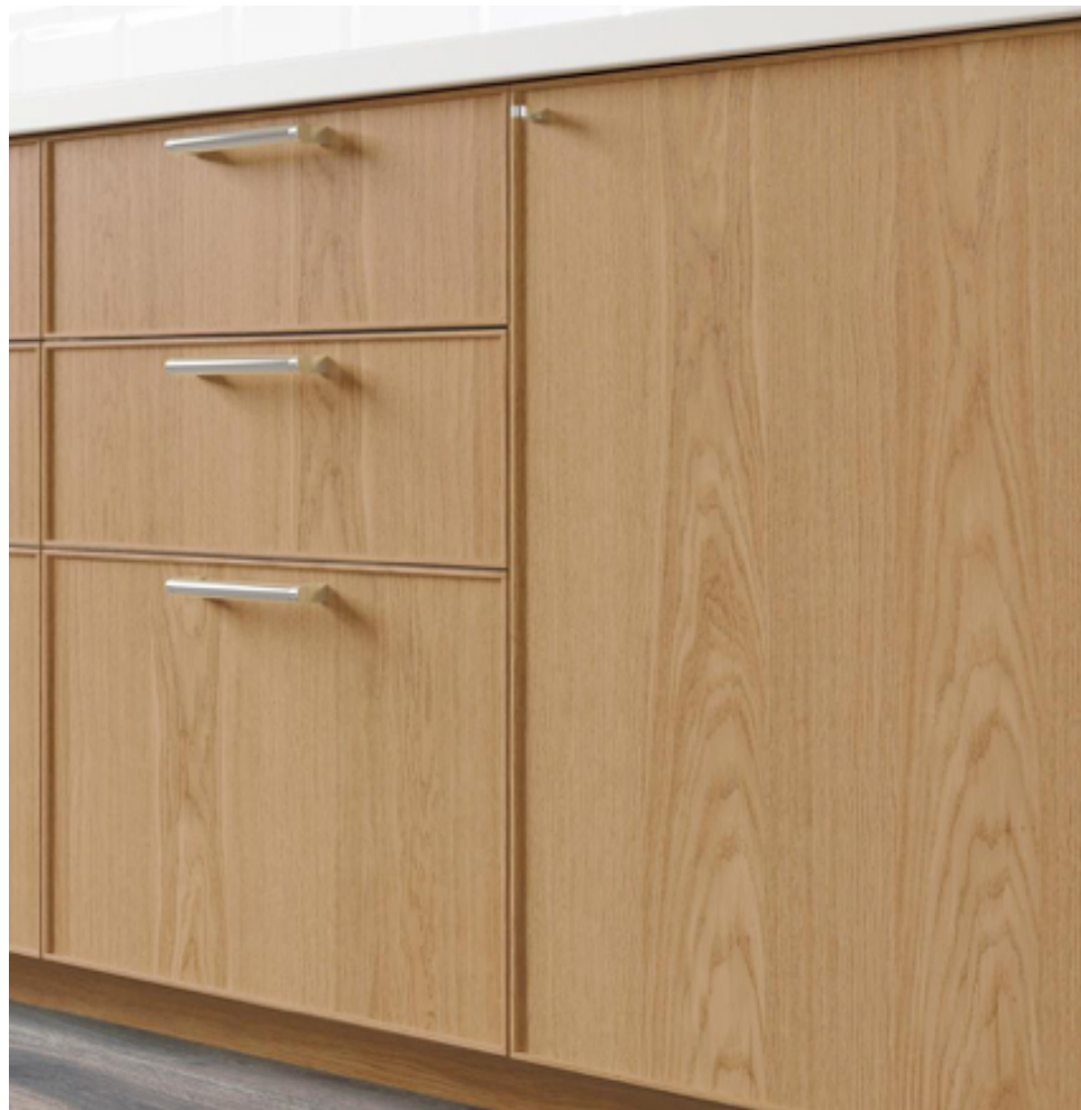
Slim shaker door profile

A modern interpretation of the classic shaker door style is the slim shaker. This fresh profile slims down the rail and stile width to 3/4" for a slimmer profile. The sleeker crisp lines give the appearance of depth without bulk.