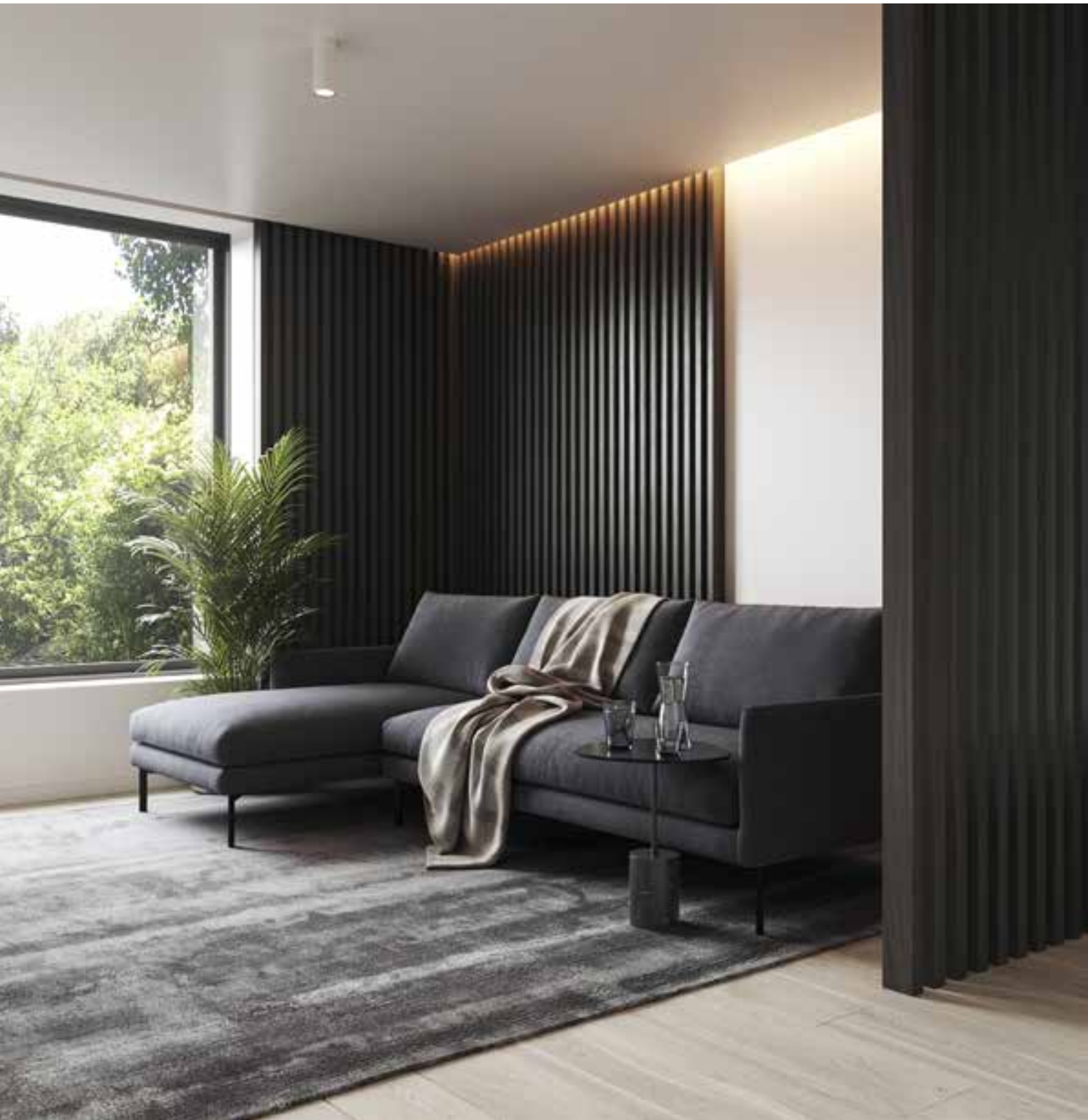
Unfinished Natural Oak - finished with darkbrown wood oil