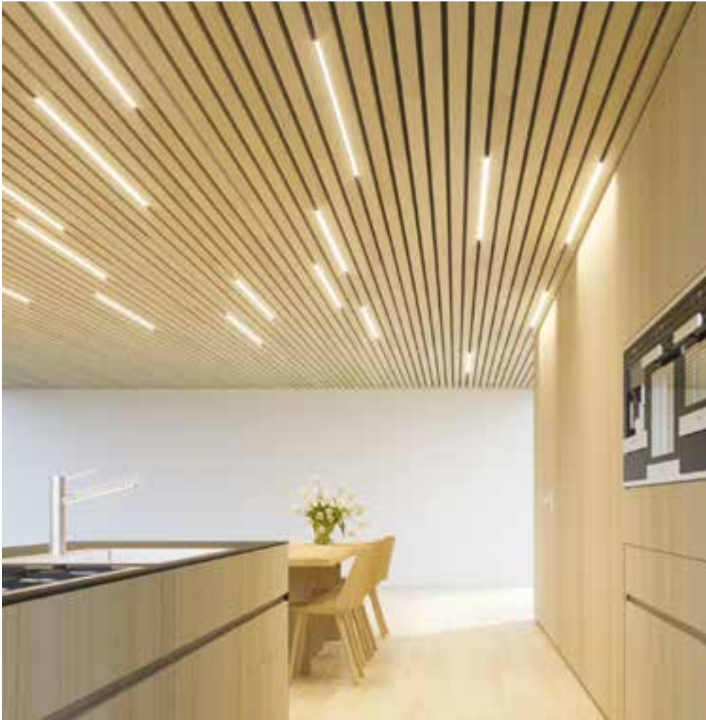
Prefinished - Ivory Oak

Astrata slats, the veneered solution for your decorative wall and ceiling coverings