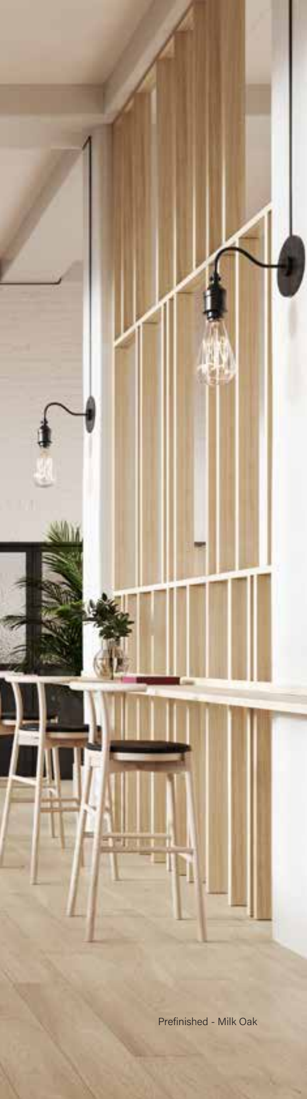
Prefinished - Milk Oak

Astrata slats, an elegant, easy-to-use room divider