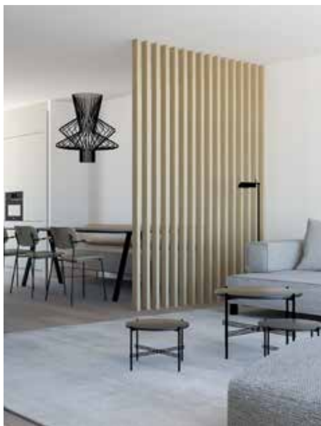
Prefinished - Ivory Oak

Astrata slats, an elegant, easy-to-use room divider