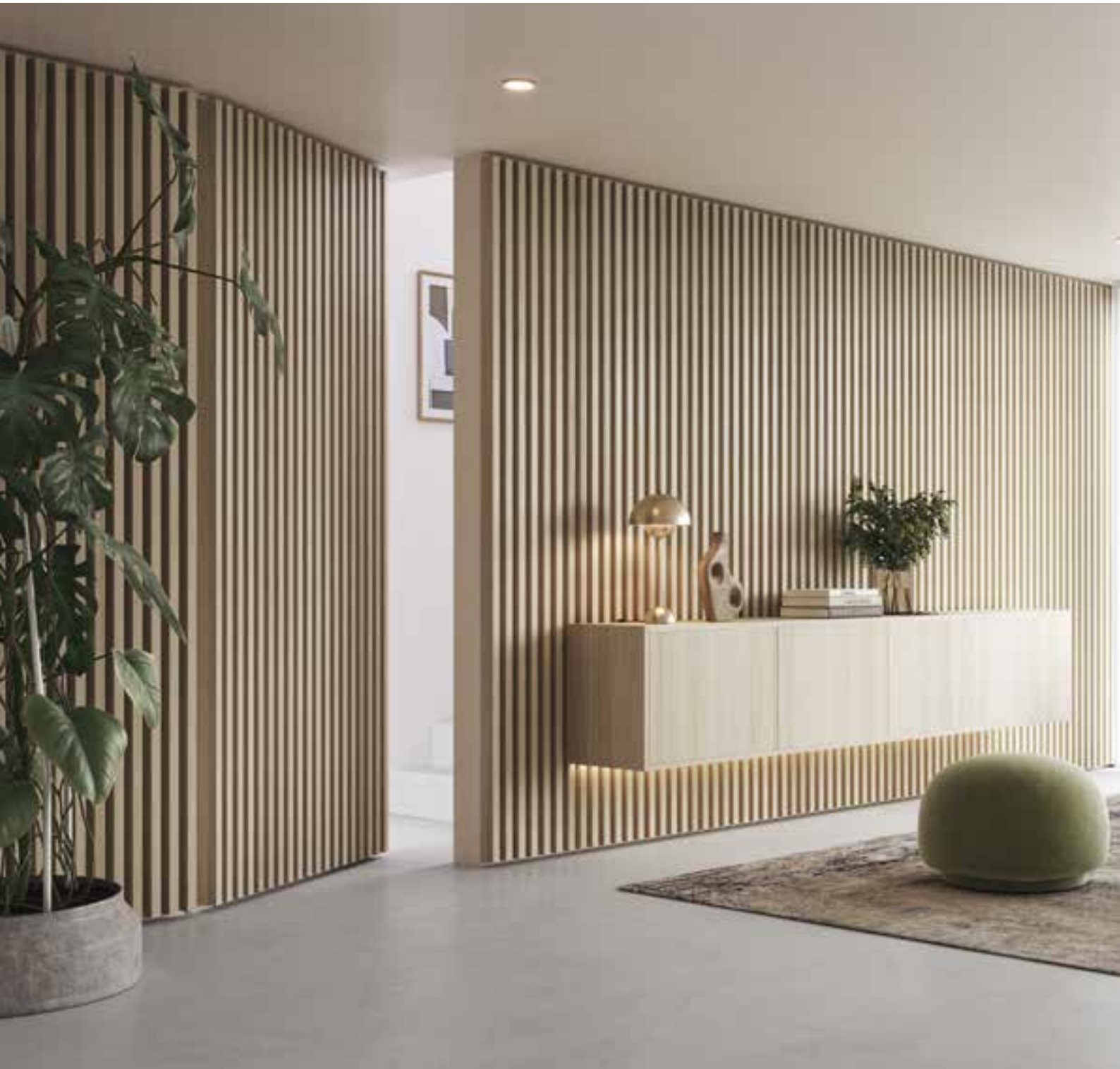
Prefinished Ivory Oak