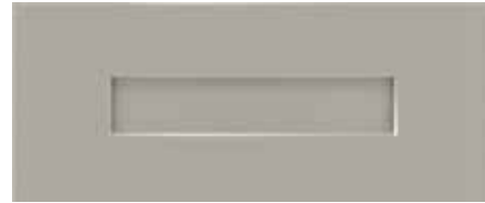
Optional 5-Piece Drawer Front