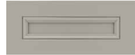
Optional 5-Piece Drawer Front