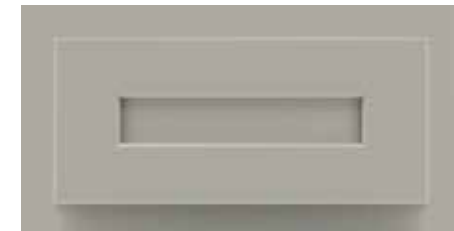
Optional 5-Piece Drawer Front