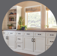
Kitchen & Bath

Find us on Instagram @ wolfhomeproducts for inspiration on your next project!