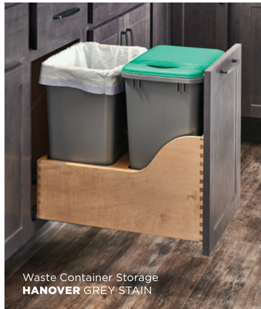
Waste Container Storage HANOVER GREY STAIN