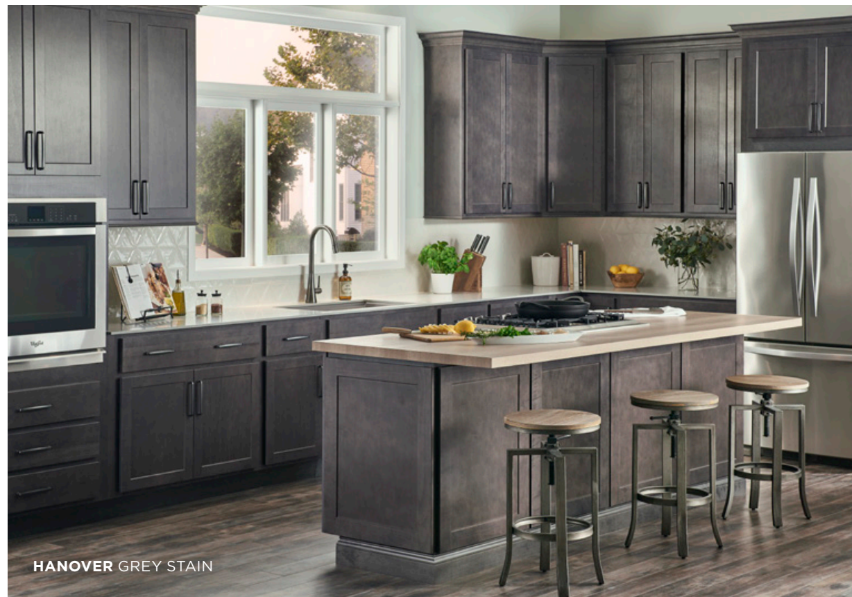
HANOVER GREY STAIN