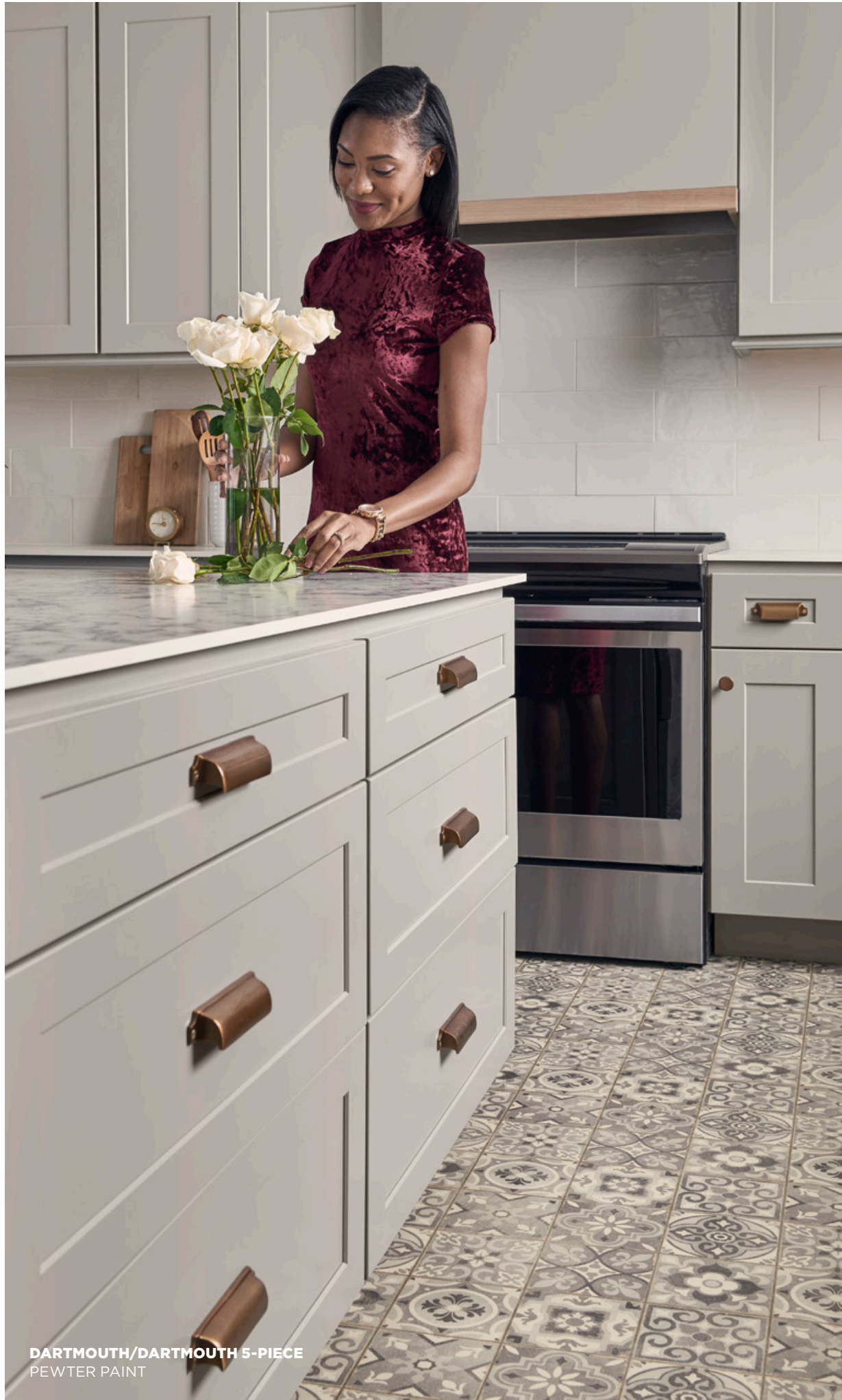
DARTMOUTH/DARTMOUTH 5-PIECE PEWTER PAINT