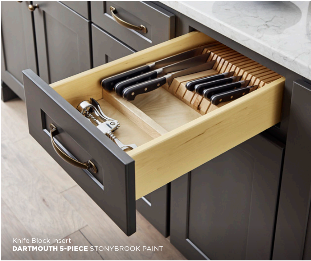
Knife Block Insert DARTMOUTH 5-PIECE STONYBROOK PAINT