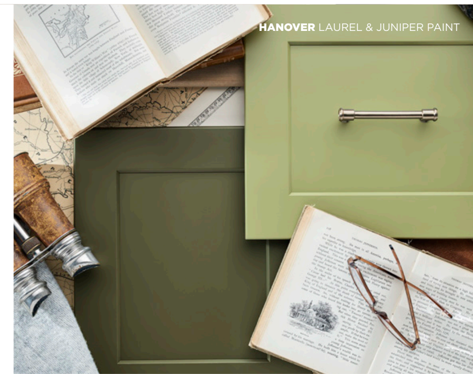
HANOVER LAUREL & JUNIPER PAINT

Personalized Solutions gives you more design flexibility with Wolf Classic cabinets so you can: