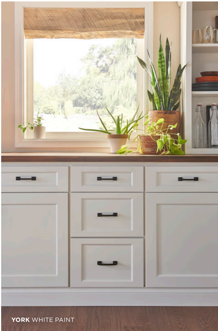
YORK WHITE PAINT