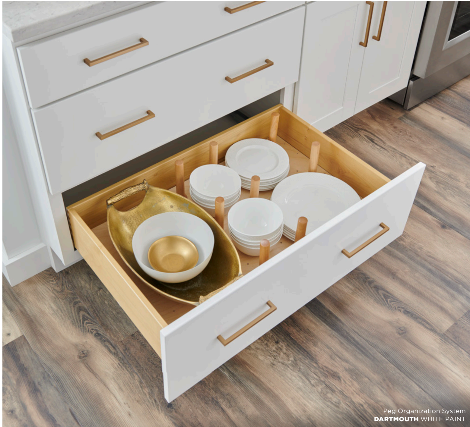
Peg Organization System DARTMOUTH WHITE PAINT

When designing Wolf Classic cabinets, we had both form and function in mind. From food storage to recycling, these simple solutions will make your space work hard for you.