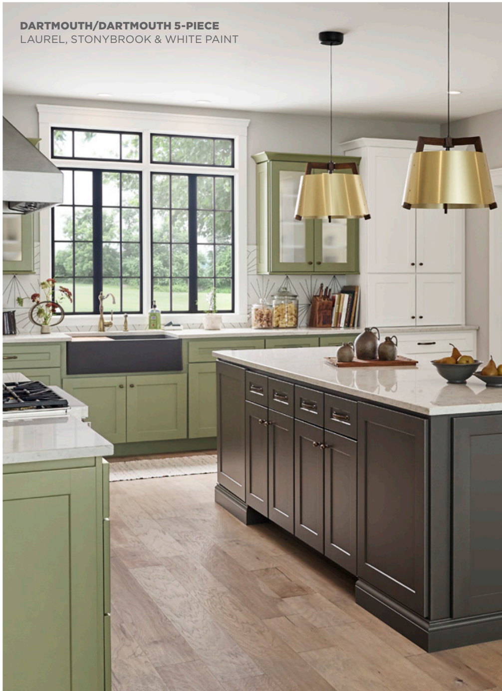
DARTMOUTH/DARTMOUTH 5-PIECE LAUREL, STONYBROOK & WHITE PAINT