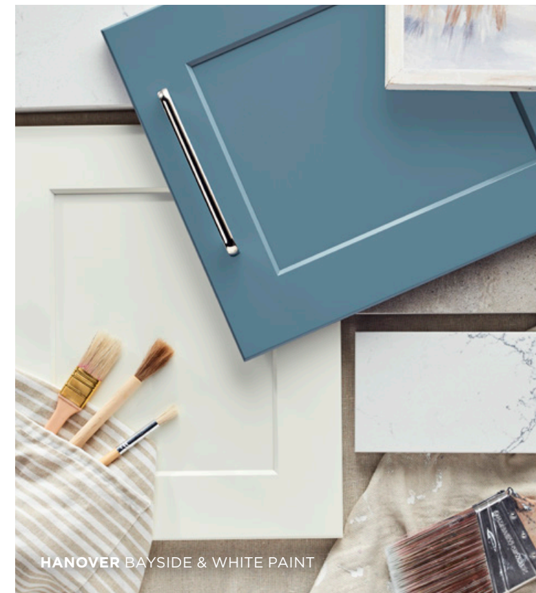
HANOVER BAYSIDE & WHITE PAINT