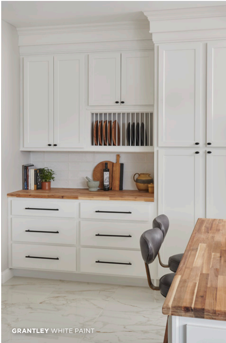
GRANTLEY WHITE PAINT