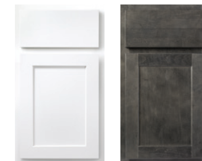
White Paint Grey Stain