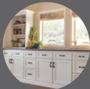
Kitchen & Bath

Find us on Instagram @ wolfhomeproducts for inspiration on your next project!