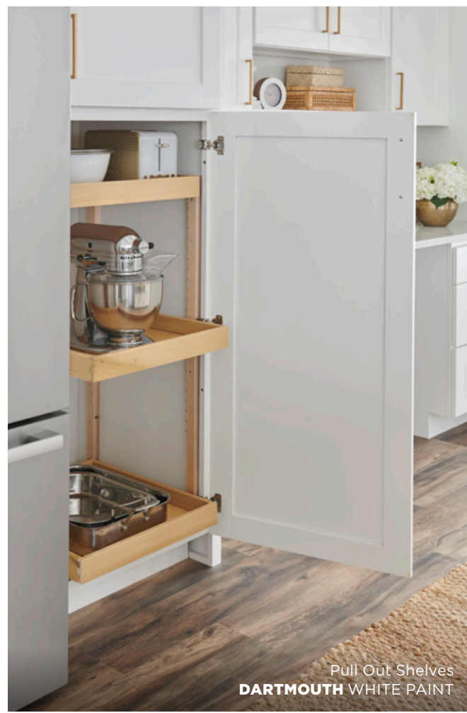
Pull Out Shelves DARTMOUTH WHITE PAINT