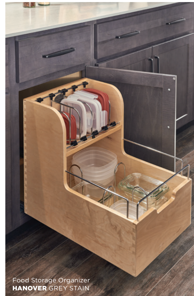
Food Storage Organizer HANOVER GREY STAIN