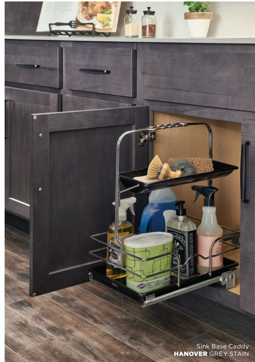
Sink Base Caddy HANOVER GREY STAIN