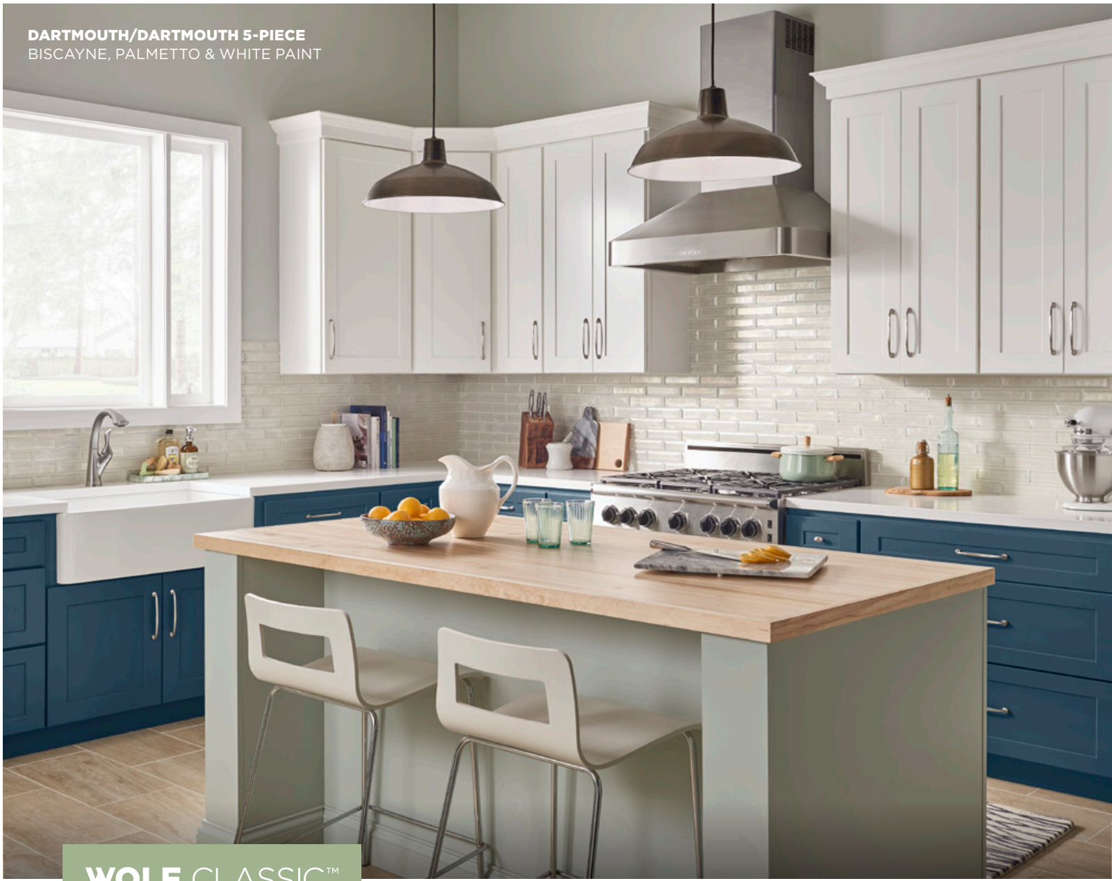
DARTMOUTH/DARTMOUTH 5-PIECE BISCAYNE, PALMETTO & WHITE PAINT