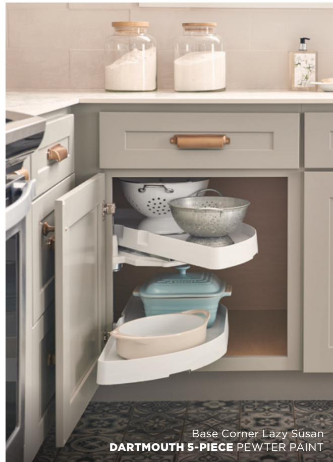
Base Corner Lazy Susan DARTMOUTH 5-PIECE PEWTER PAINT