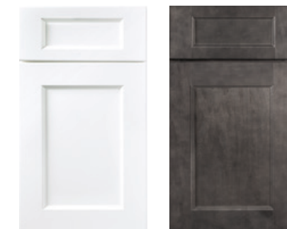
White Paint Grey Stain