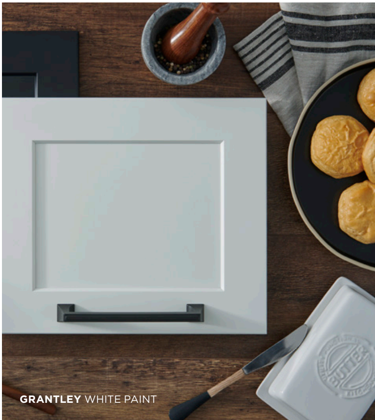
GRANTLEY WHITE PAINT