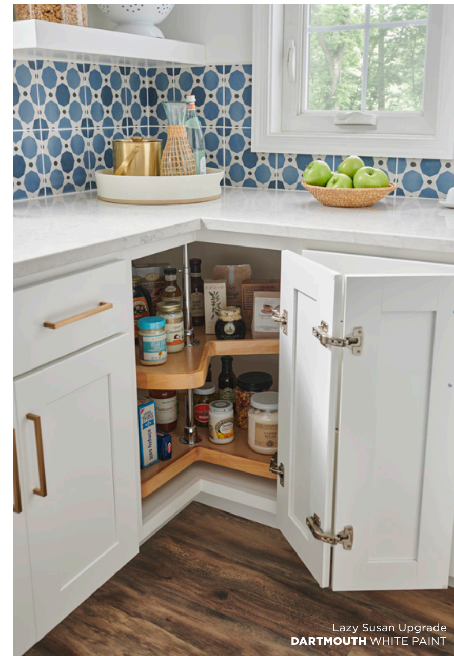
Lazy Susan Upgrade DARTMOUTH WHITE PAINT