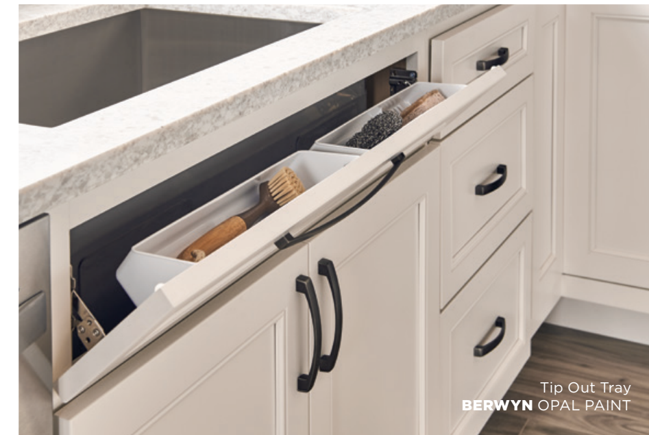
Tip Out Tray BERWYN OPAL PAINT

With this program, Wolf Classic becomes a complete cabinetry solution – so not only can you make a customized design statement, but you'll also enjoy extra design flexibility, easily accommodate the character of your space and incorporate the latest trends in vibrant colors – all in a fraction of the time. Just think outside the box.