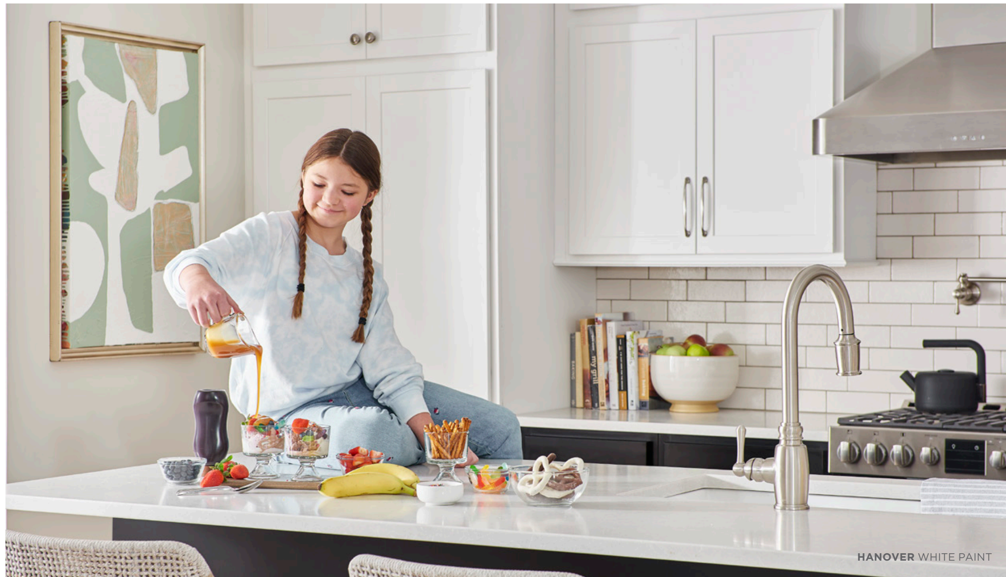
HANOVER WHITE PAINT