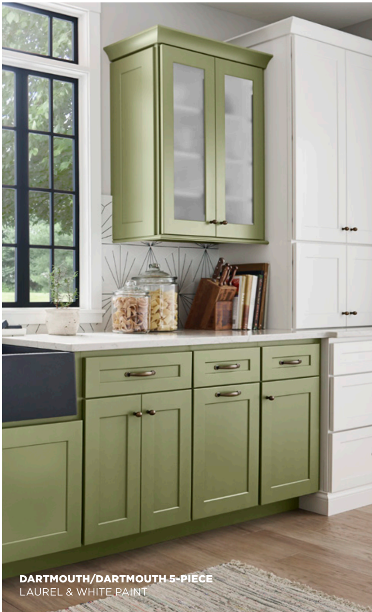
DARTMOUTH/DARTMOUTH 5-PIECE LAUREL & WHITE PAINT