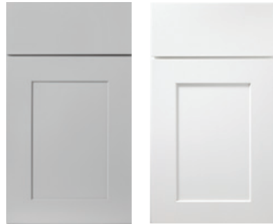
Pewter Paint White Paint

Also available in nine special order finishes. See page 32 to learn more about WOLF CLASSIC™ COMPLEMENTS