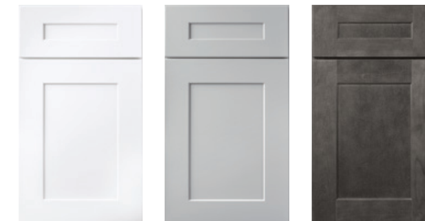
White Paint Pewter Paint Grey Stain