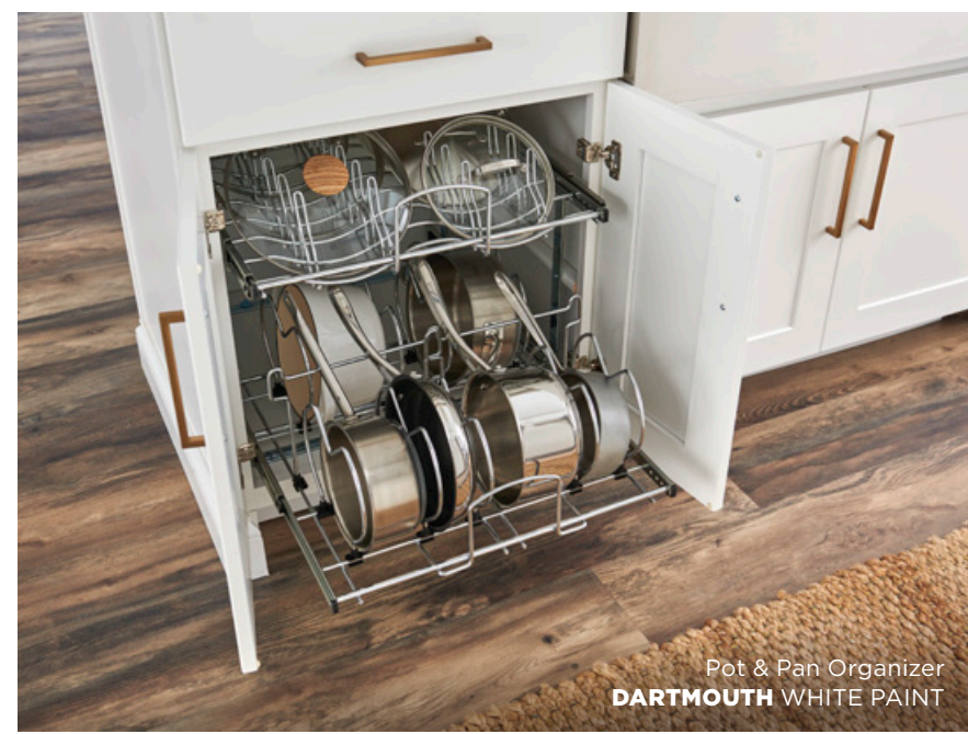
Pot & Pan Organizer DARTMOUTH WHITE PAINT