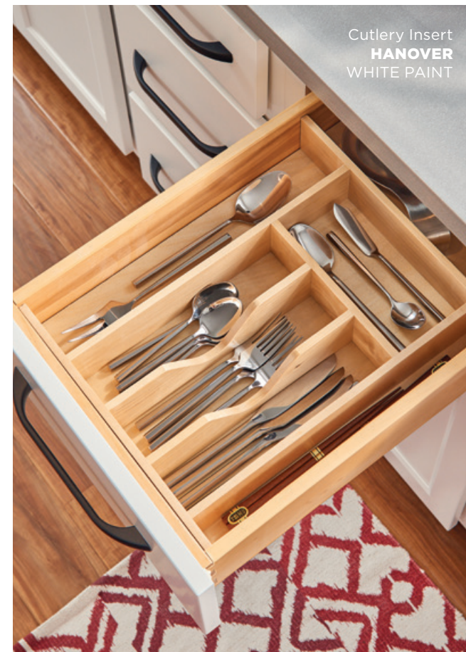
Cutlery Insert HANOVER WHITE PAINT