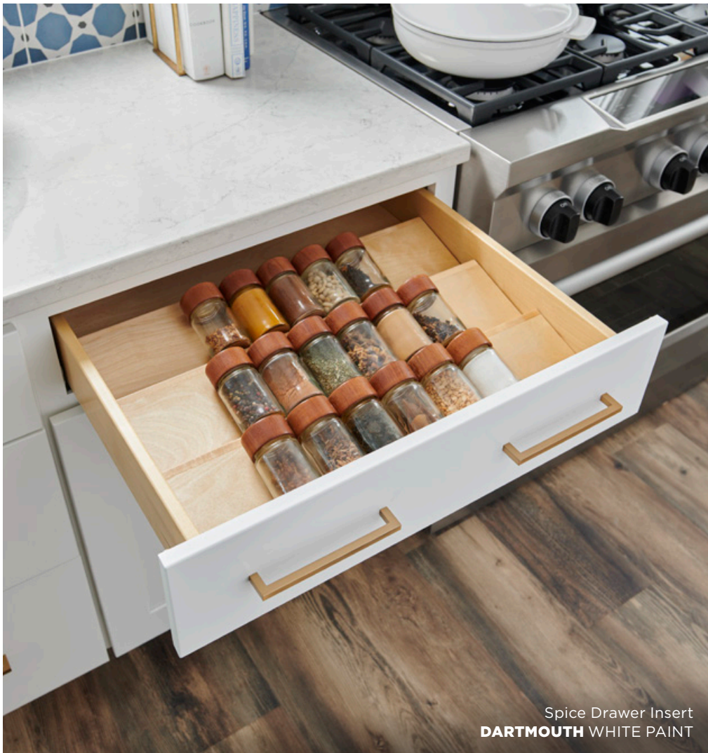
Spice Drawer Insert DARTMOUTH WHITE PAINT