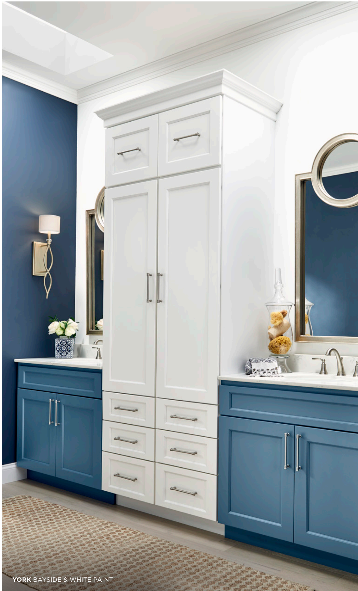
YORK BAYSIDE & WHITE PAINT