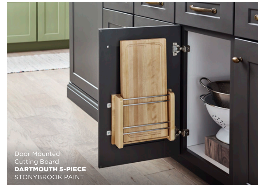
Door Mounted Cutting Board DARTMOUTH 5-PIECE STONYBROOK PAINT