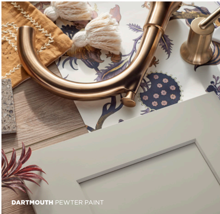
DARTMOUTH PEWTER PAINT