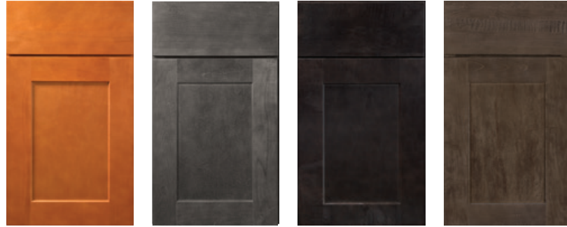
Honey Stain Grey Stain Dark Sable Stain Brownstone Stain