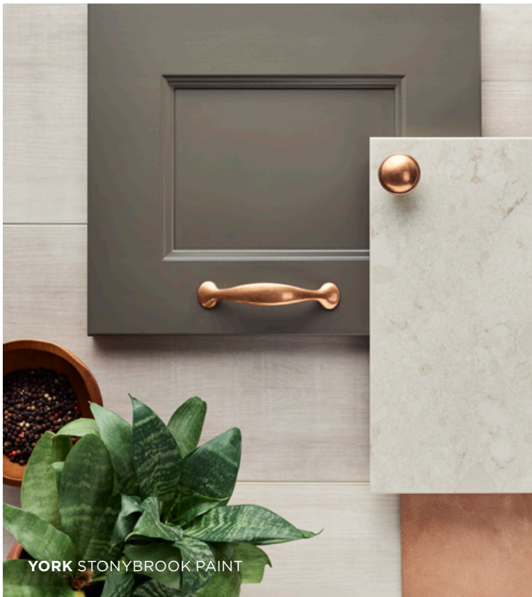
YORK STONYBROOK PAINT