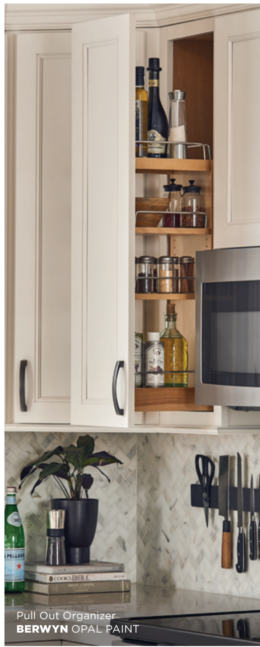
Pull Out Organizer BERWYN OPAL PAINT