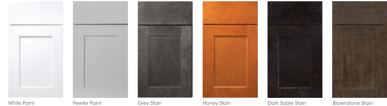
White Paint Pewter Paint Grey Stain Honey Stain Dark Sable Stain Brownstone Stain