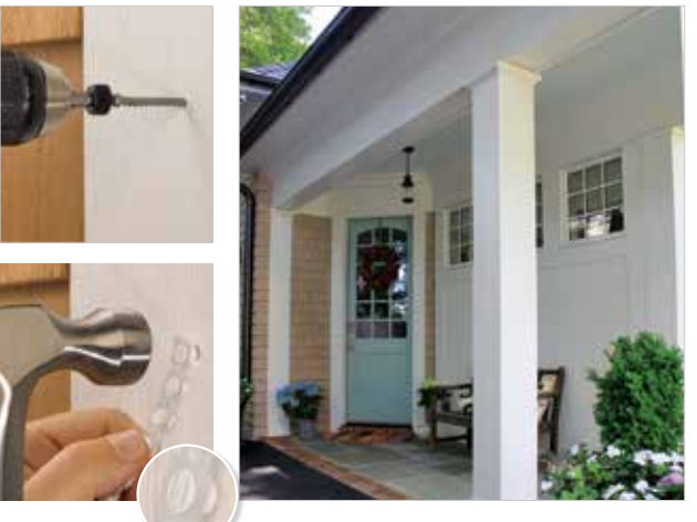
Close up of pre-aligned grain plug