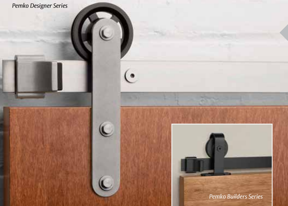
Pemko Designer Series