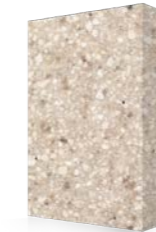
White Sands 6636