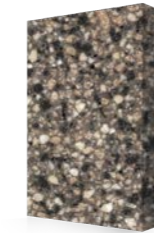
Crushed Lava 6637 - MOQ