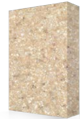
Palm Desert 6638 - MOQ