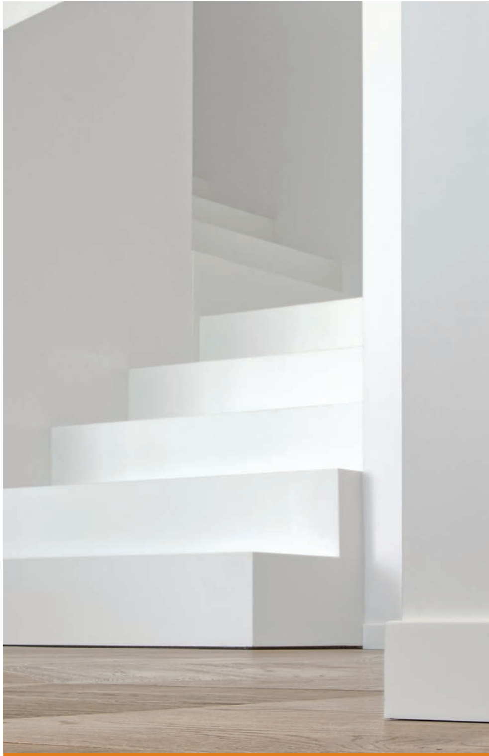
Private Facade Ibiza Architect: Laurence Sonck Fabricator: M2 IBIZA CONSTRUCT SL

Avonite Surfaces® and STUDIO Collection® have product-specific Type III EPDs, the gold standard in these reports, that are 3rd party certified to conform to ISO 14025, and based on an externally-verified LCA conforming to ISO 14044. The two brands' EPDs are LEED v4 compliant.