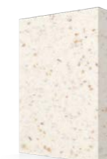
Honey Crunch 4330

Three Avonite Surfaces® colors contain an average minimum 16% pre-consumer recycled content. Recycled content levels are certified by SCS Global Services, and contribute to LEED v4 credits.