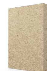
Khaki 4331 MOQ