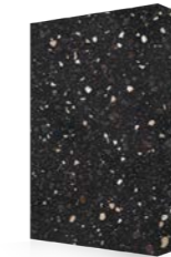
Back Roads 6640 - MOQ