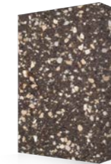
Brown Sugar 6641 - MOQ