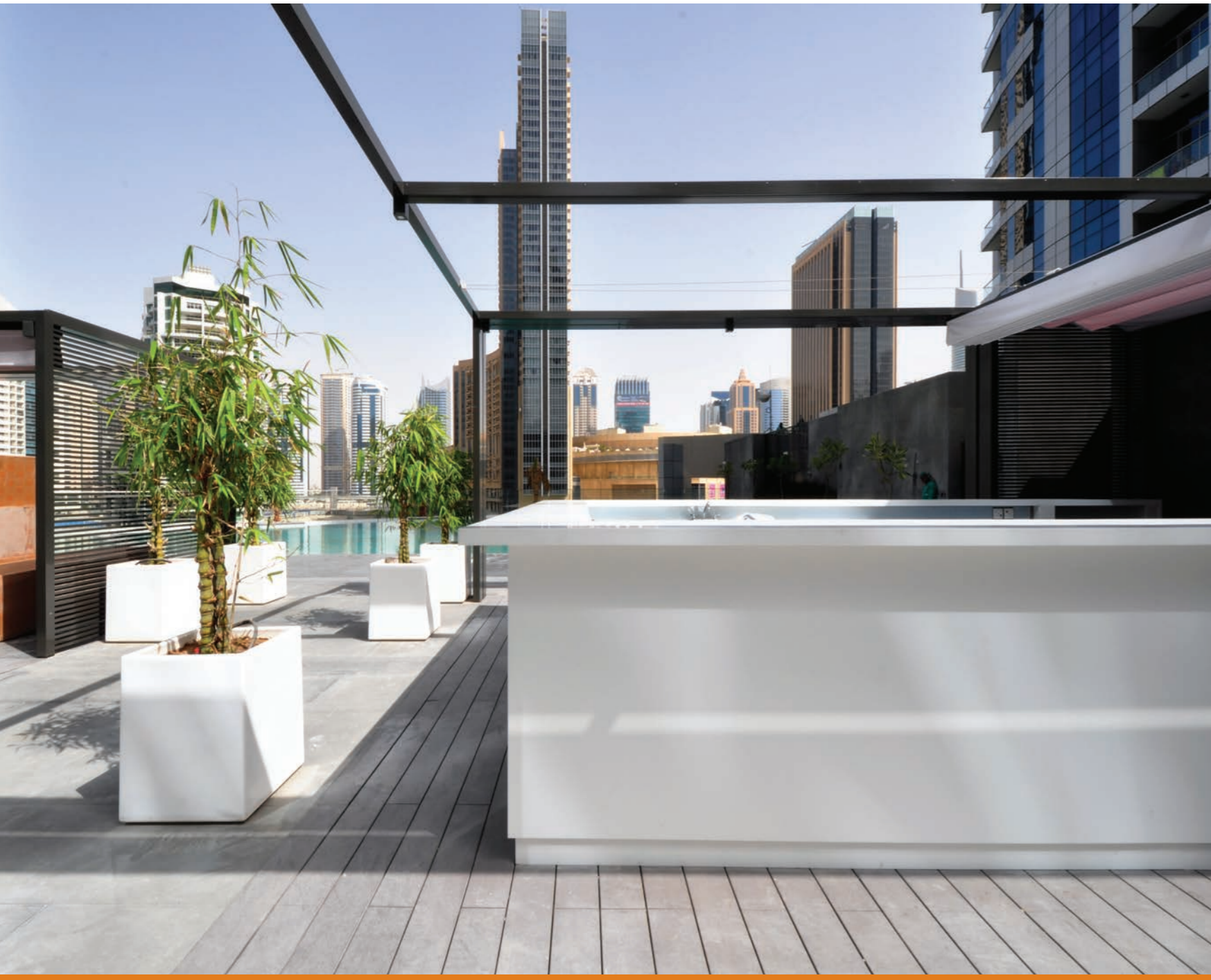
Intercontinental Hotel Dubai Marina Central Bay

Avonite Surfaces® solid surface is Living Building Challenge Red List Free, containing none of the 800+ hazardous chemicals found in some building products.