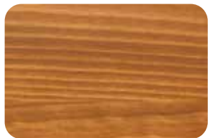
Honey Pine Pine