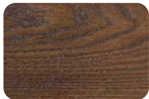
Rustic Brown Oak