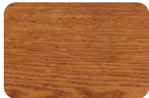
Honey Pine Oak