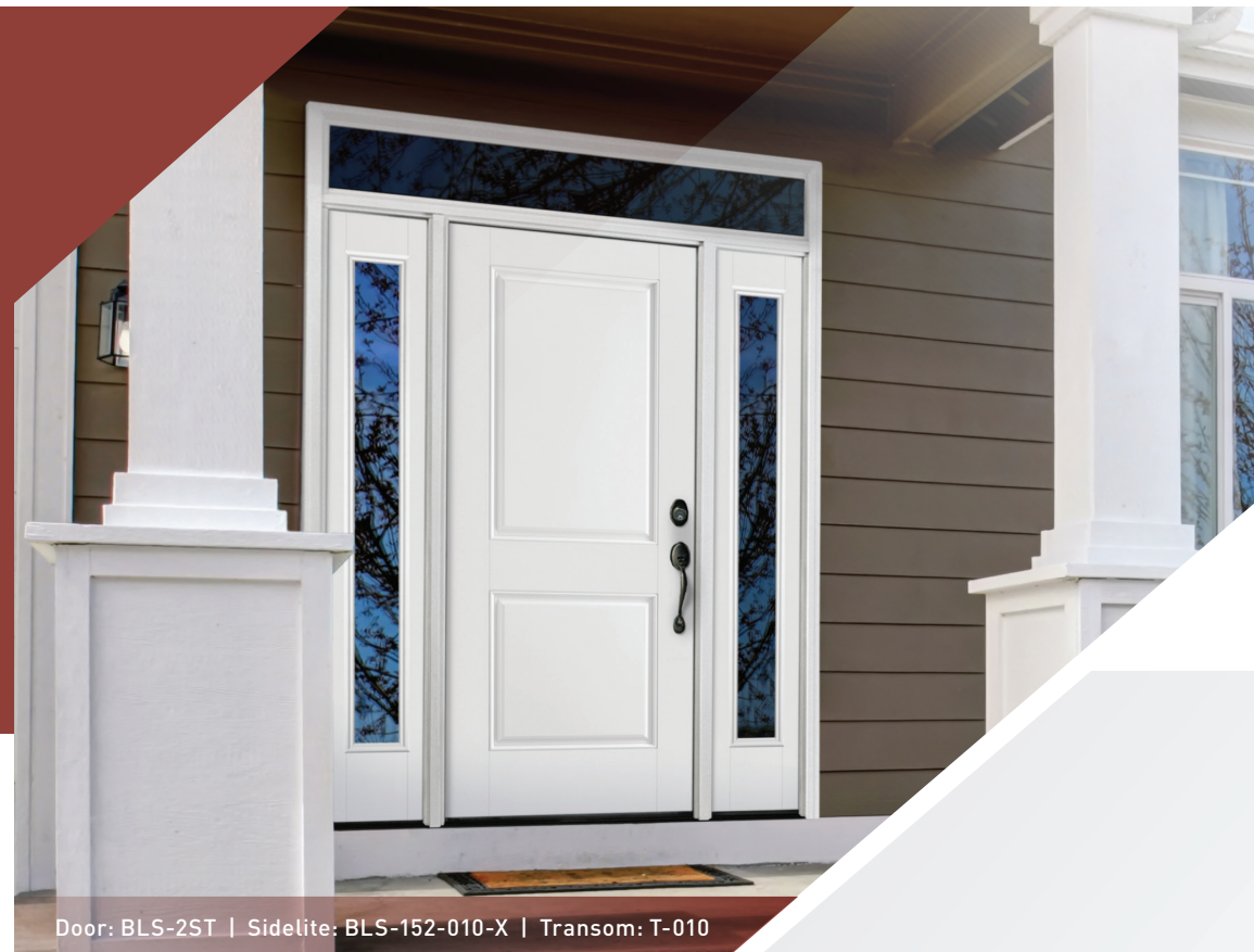
Door: BLS-2ST | Sidelite: BLS-152-010-X | Transom: T-010