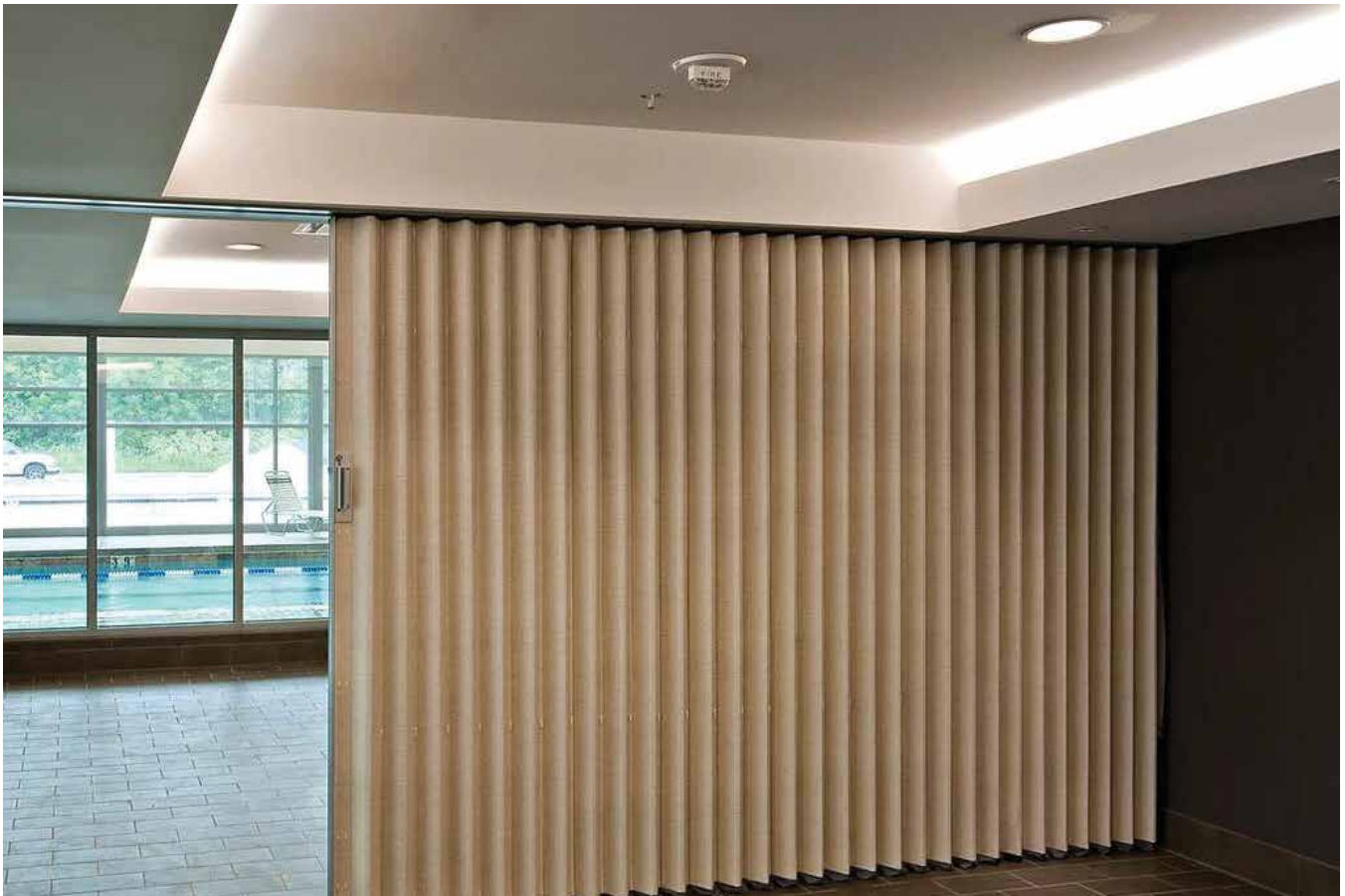
STC 41 test performed by Riverbank Acoustical Laboratories, Geneva, IL ASTM designation E90-86T