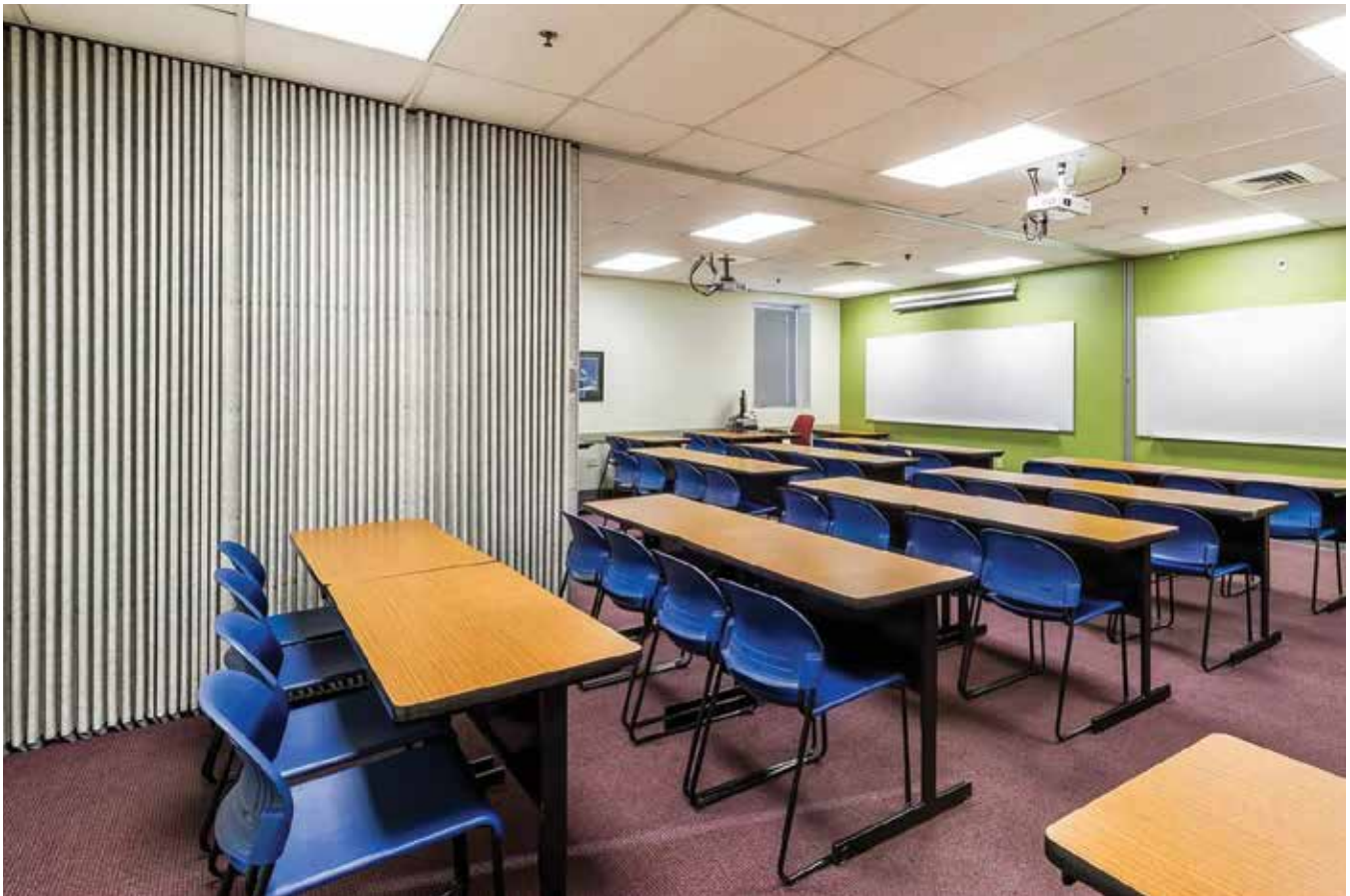
STC 31 test performed by Riverbank Acoustical Laboratories, Geneva, IL. ASTM designation E90-86T