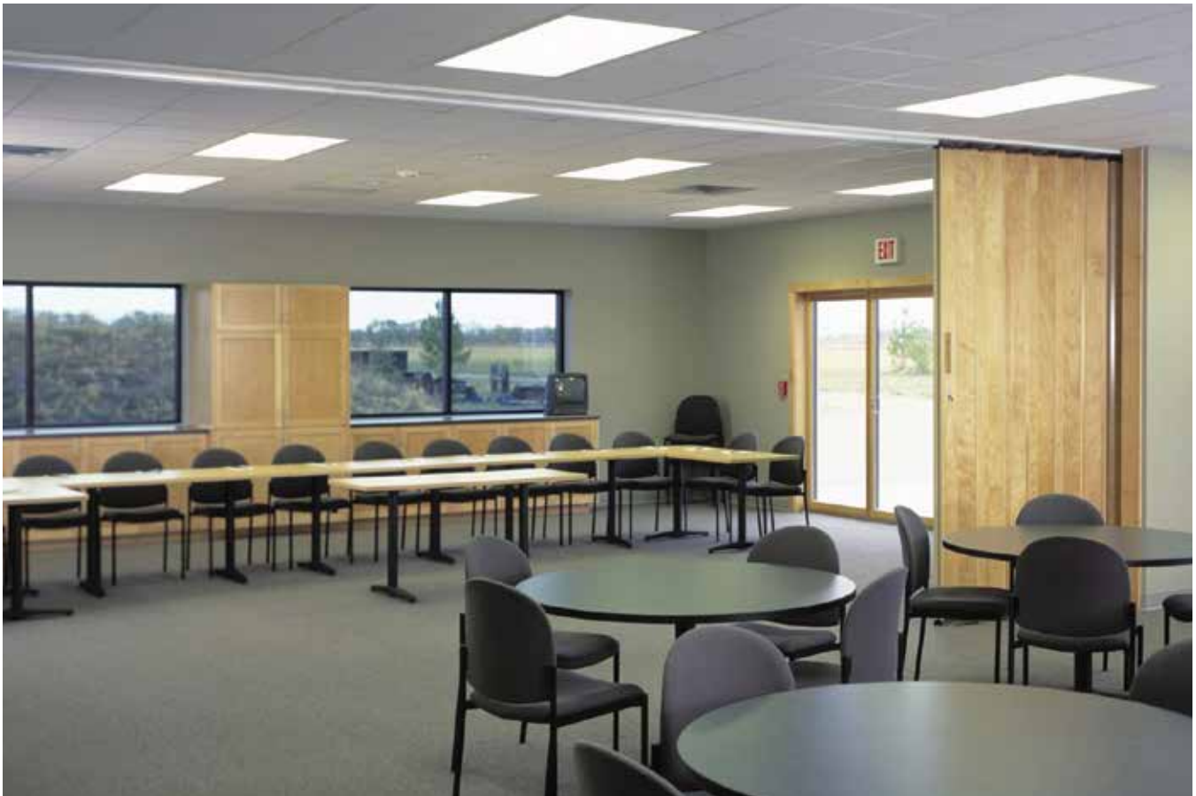
FSTC 33 test performed by Bruck, Richards & Chaudiere, Inc. ASTM designation E336-77