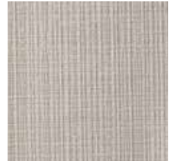
H Series Vinyl

Full specifications are available via our website: www.woodfold.com/finishes