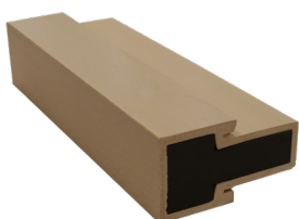
Co-Extruded LVL Mull Post with Composite Bottom

FrontLine's Composite frame is a unique formulation that combines the strength and stability of wood without the rotting, warping and splitting. The FrontLine® Composite Frame is resistant to mold, mildew, fungus, salt, chemicals, insects, and pollutants, leaving your entryway frame maintenance-free! The FrontLine® Composite Frame has the same shape designs, use, and functionality as wood, and can be similarly painted, stained, nailed, and machined.