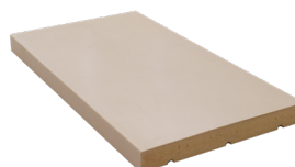
Primed Flat Jamb