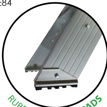
RUBBERIZED FOOT PADS