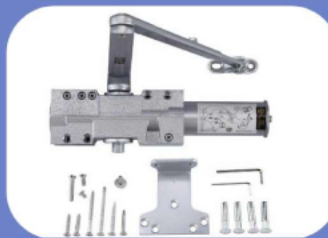
Alrex Hinge Door Closer

(Around 1 hour - Not including hinge install)