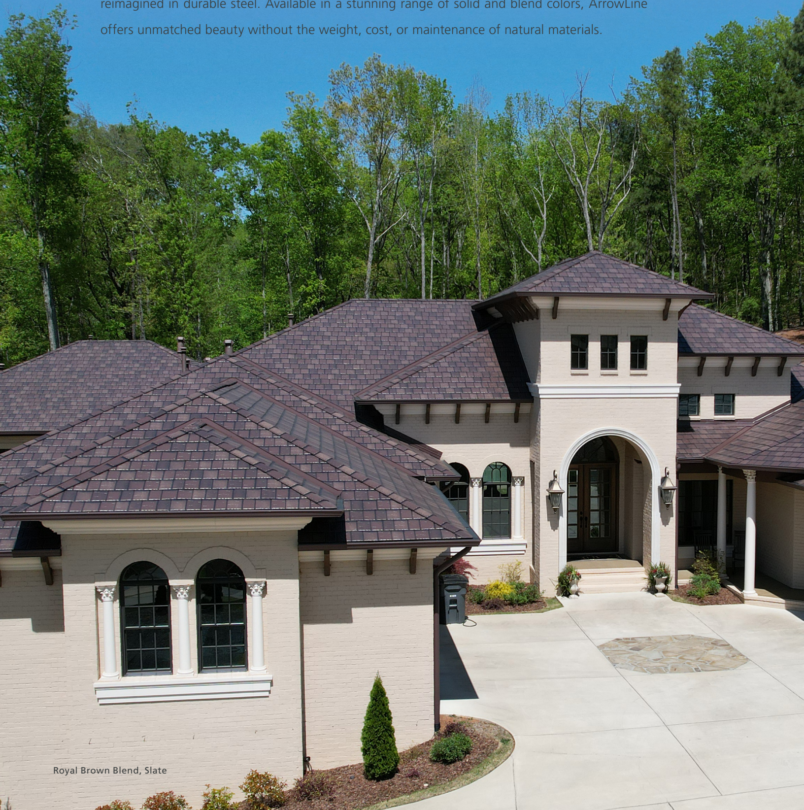
Royal Brown Blend, Slate

Experience the timeless elegance of hand-split cedar shakes or the refined allure of slate, reimagined in durable steel. Available in a stunning range of solid and blend colors, ArrowLine offers unmatched beauty without the weight, cost, or maintenance of natural materials.