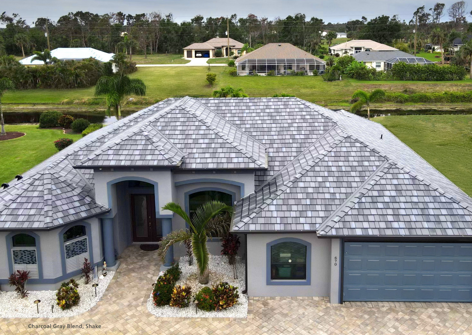
Charcoal Gray Blend, Shake

ABOUT EDCO With over 75 years of trusted expertise and an unwavering commitment to excellence, EDCO Products combines elevated design and exceptional craftsmanship, delivering premium Siding, Roofing,