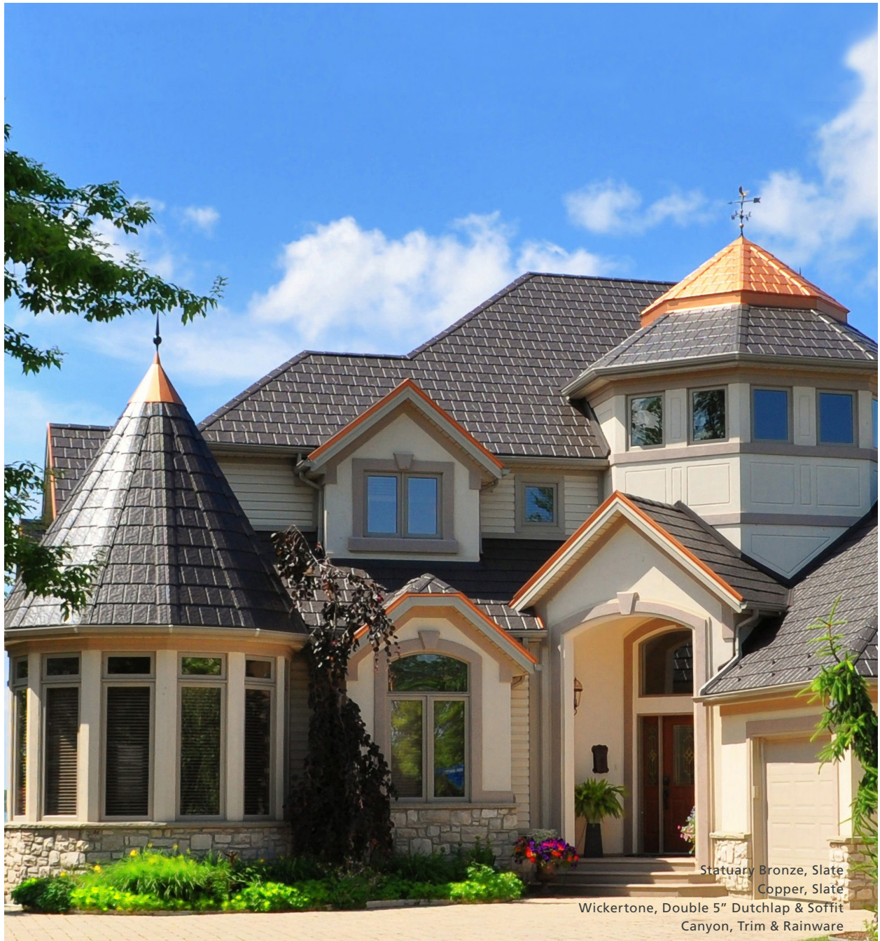
Statuary Bronze, Slate Copper, Slate Wickertone, Double 5" Dutchlap & Soffit Canyon, Trim & Rainware