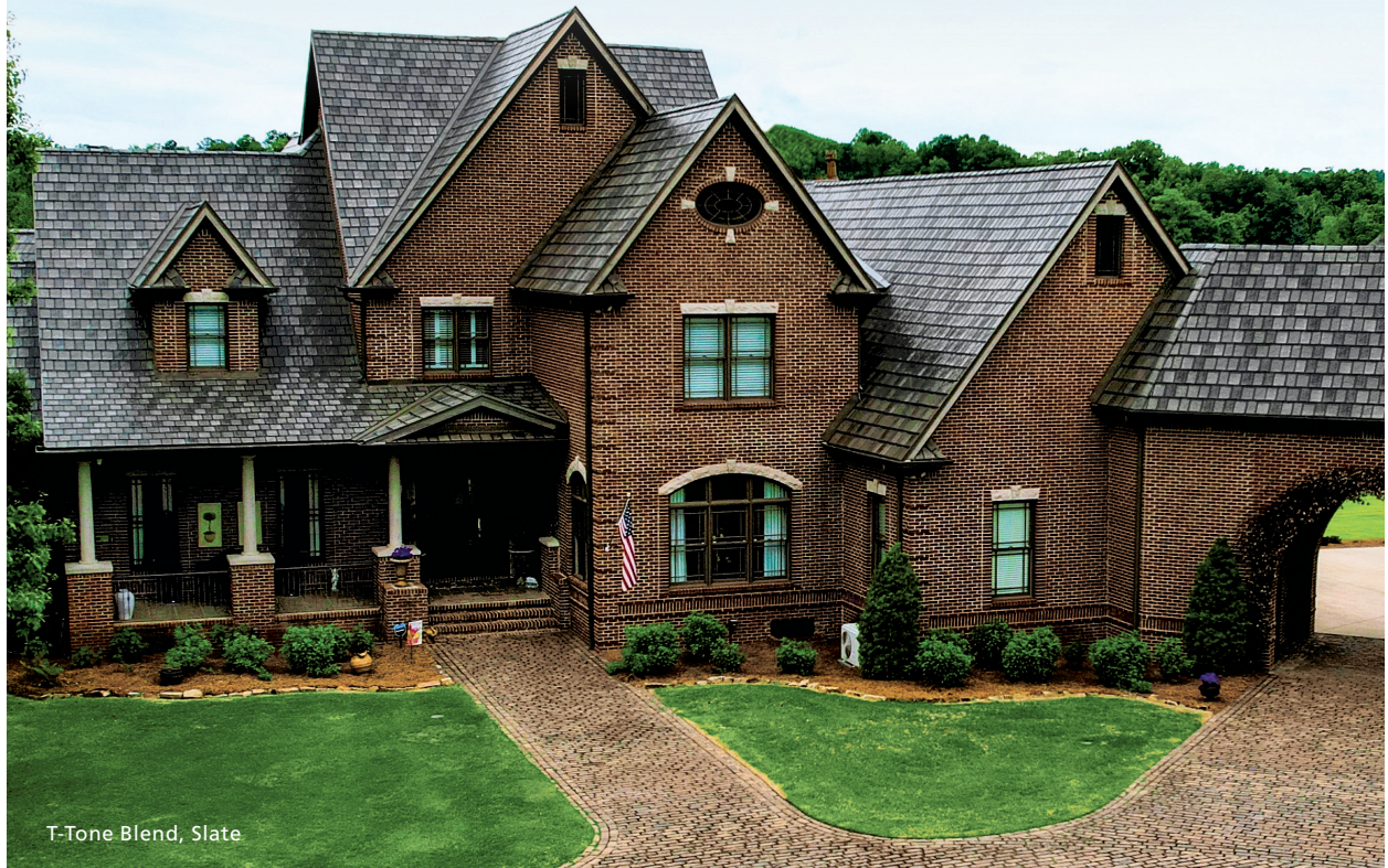
T-Tone Blend, Slate

> Get more ideas flowing by visiting EDCO's Inspiration Gallery