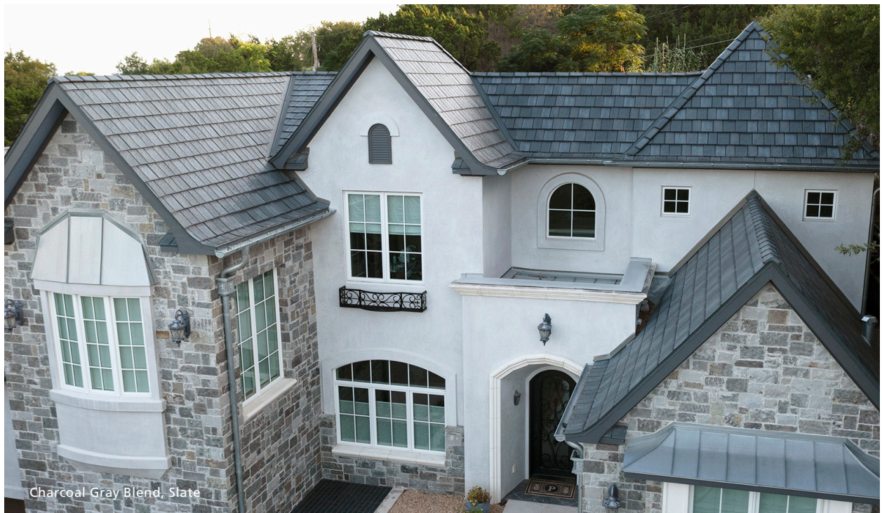
Charcoal Gray Blend, Slate