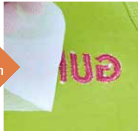
wrong fabric side

TIP: Cut STICK PROTECT generously – round off corners – approx. 2 – 3 cm larger than the embroidery design.