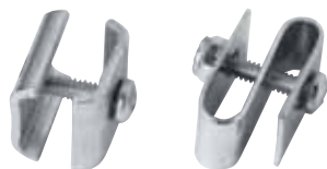
Mounting Kit for Enclosure Panel