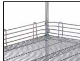
4" (102mm) Ledge

Ledges may also be used on the interior of a shelf (lengthwise) by attaching directly above a snake truss. Interior snake trusses are found on shelf widths of 21" (530mm) and larger.