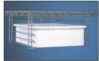
Super Erecta Slide System in place on shelf (Tote box sold separately)