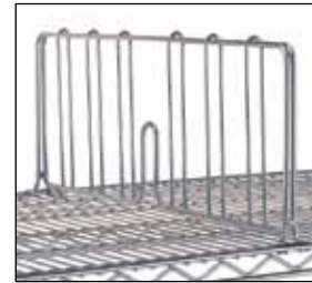
Shelf Divider for Super Erecta Shelves

For OTR applications, additional clamping may be required to keep dividers in place. Consult Metro engineering.