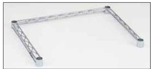
Three-sided Double Snake Frame

All Metro Catalog Sheets are available on our website: www.metro.com