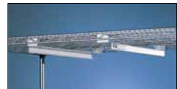
Adjustable Undershelf Slide

*Not adaptable to 24" (610mm) long shelf.