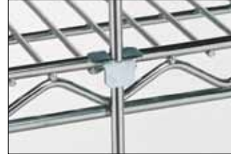
Rod with Tab in place