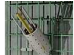
FC1 and FCH