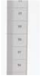
Posts are numbered at 1" (25mm) intervals.