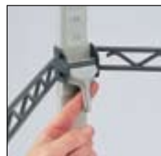
MetroMaxQ Corner Lock Release™