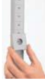
Wedge connector attaches easily to post.