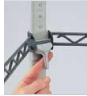
Corner Lock Release™ pulls out easily to unlock shelf for repositioning.