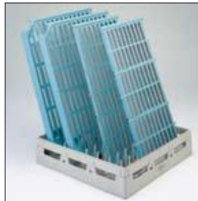
Shelf mat sections fit in the dishwasher for easy, thorough cleaning.