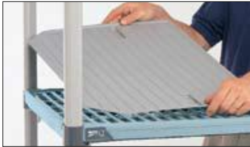
Open-grid shelf mats remove quickly for cleaning.