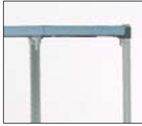
Shelf fits tightly over wedge connector.