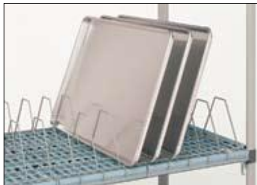
Tray Drying Rack