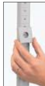
MetroMax Q Wedge Connector Included with each shelf or shelf frame. Bag of 4. Cat. No. Q9985