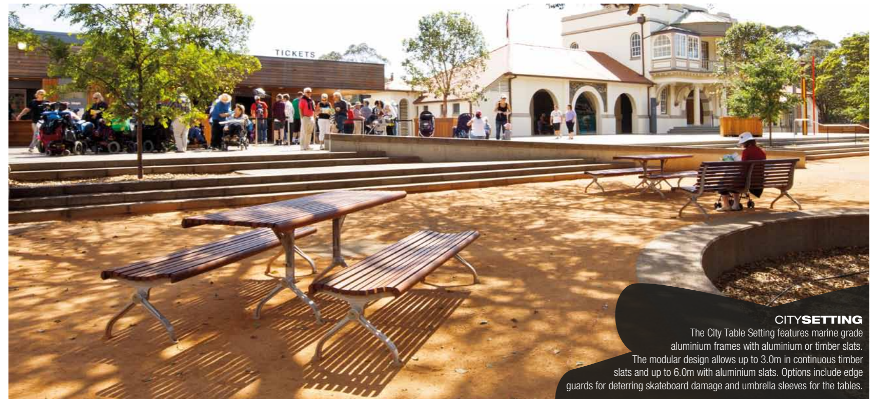
CITY SETTING The City Table Setting features marine grade aluminium frames with aluminium or timber slats. The modular design allows up to 3.0m in continuous timber slats and up to 6.0m with aluminium slats. Options include edge guards for deterring skateboard damage and umbrella sleeves for the tables.