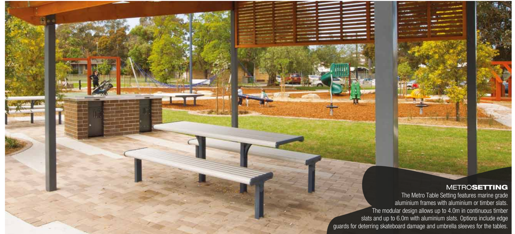
METRO SETTING The Metro Table Setting features marine grade aluminium frames with aluminium or timber slats. The modular design allows up to 4.0m in continuous timber slats and up to 6.0m with aluminium slats. Options include edge guards for deterring skateboard damage and umbrella sleeves for the tables.