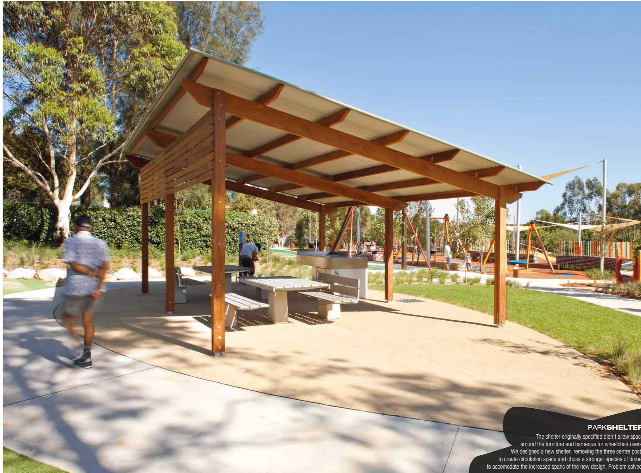
PARKSHELTER The shelter originally specified didn't allow space around the furniture and barbeque for wheelchair users. We designed a new shelter, removing the three centre posts to create circulation space and chose a stronger species of timber to accommodate the increased spans of the new design. Problem solved!