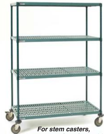
For stem casters, see catalog sheet #11.20