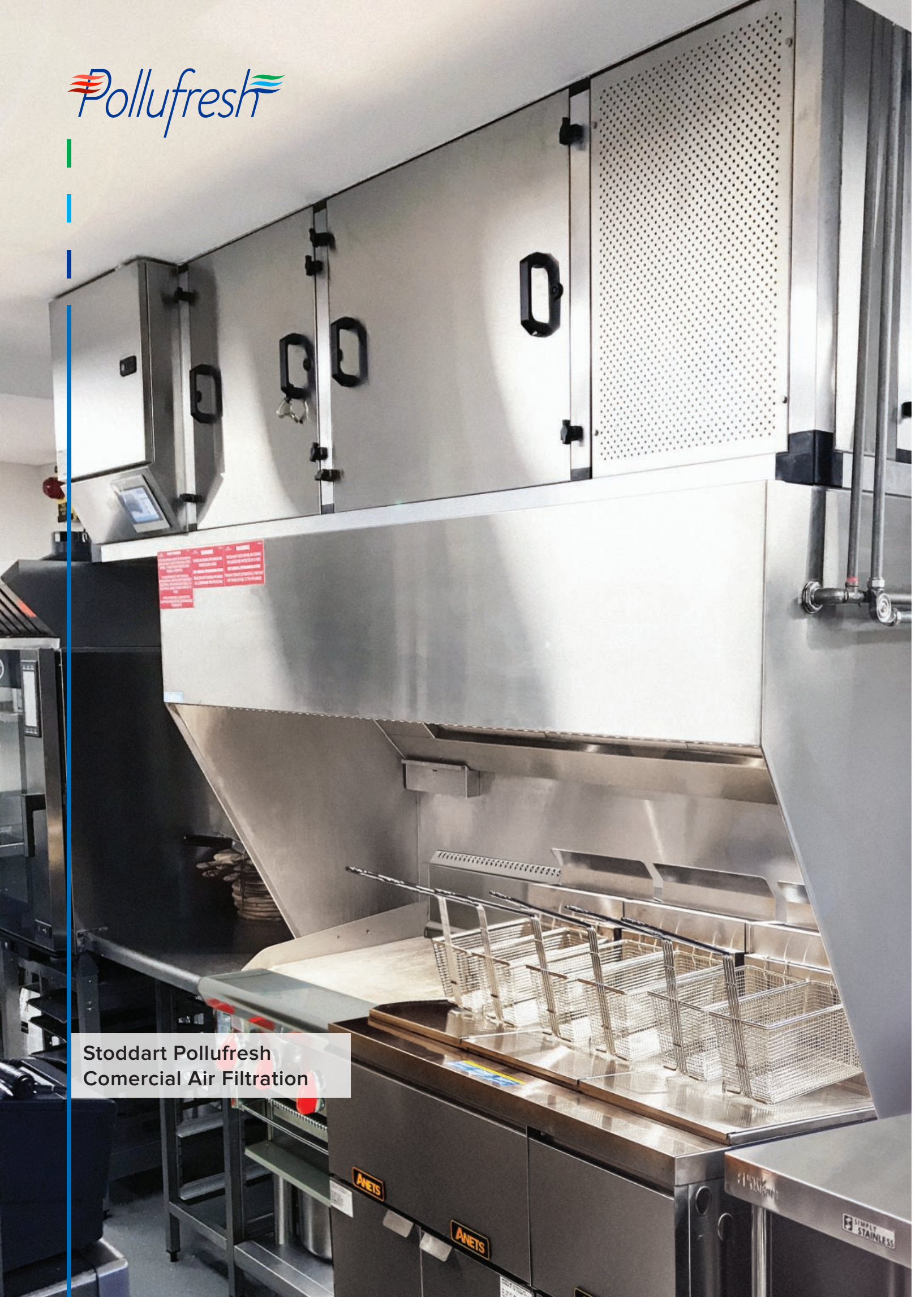
Stoddart Pollufresh Comercial Air Filtration