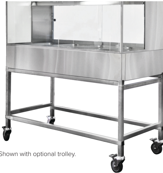
Shown with optional trolley.