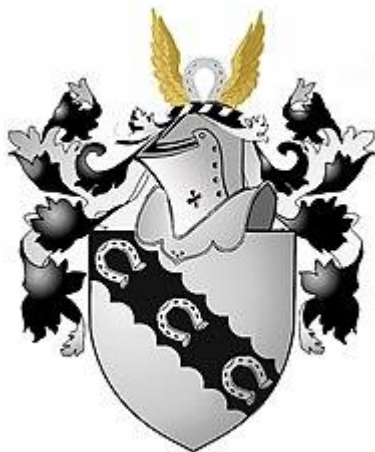
Farrar family coat of arms