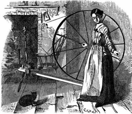
SPINNING BY HAND WITH A SINGLE SPINDLE.

Hand-spinning was a crucial process in cloth-making before the introduction of powered industrial processes in mills, but it and other wool processes are in many ways now poorly understood. Fresh insights into yarn-supply