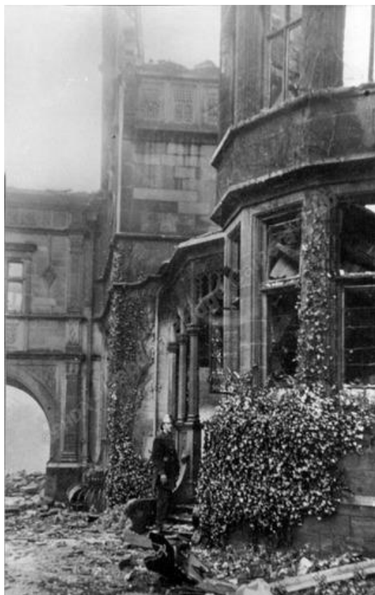
After the fire