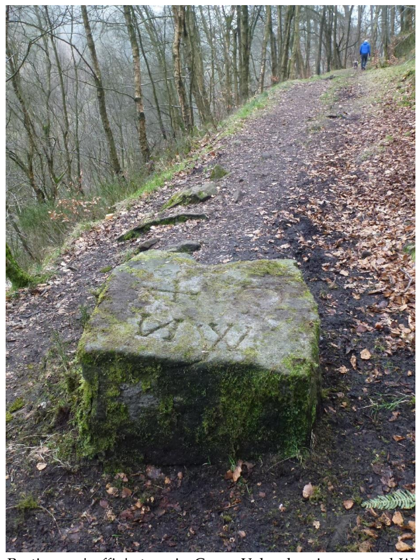
Resting or 'coffin' stone in Cragg Vale, showing crossed-W Marian Mark