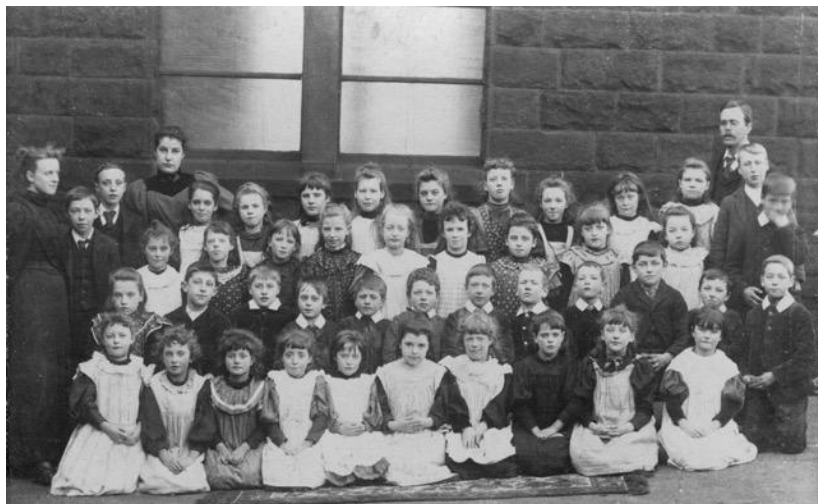
Colden School c1900