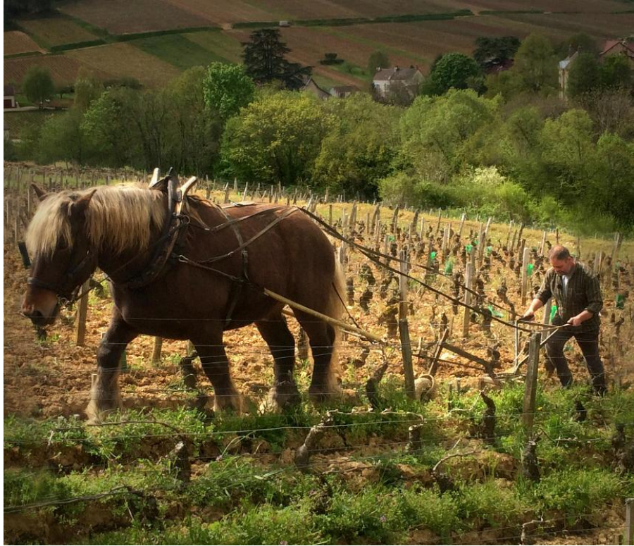
Frédéric plowing with a horse to enhance soil aeration and reduce compacting