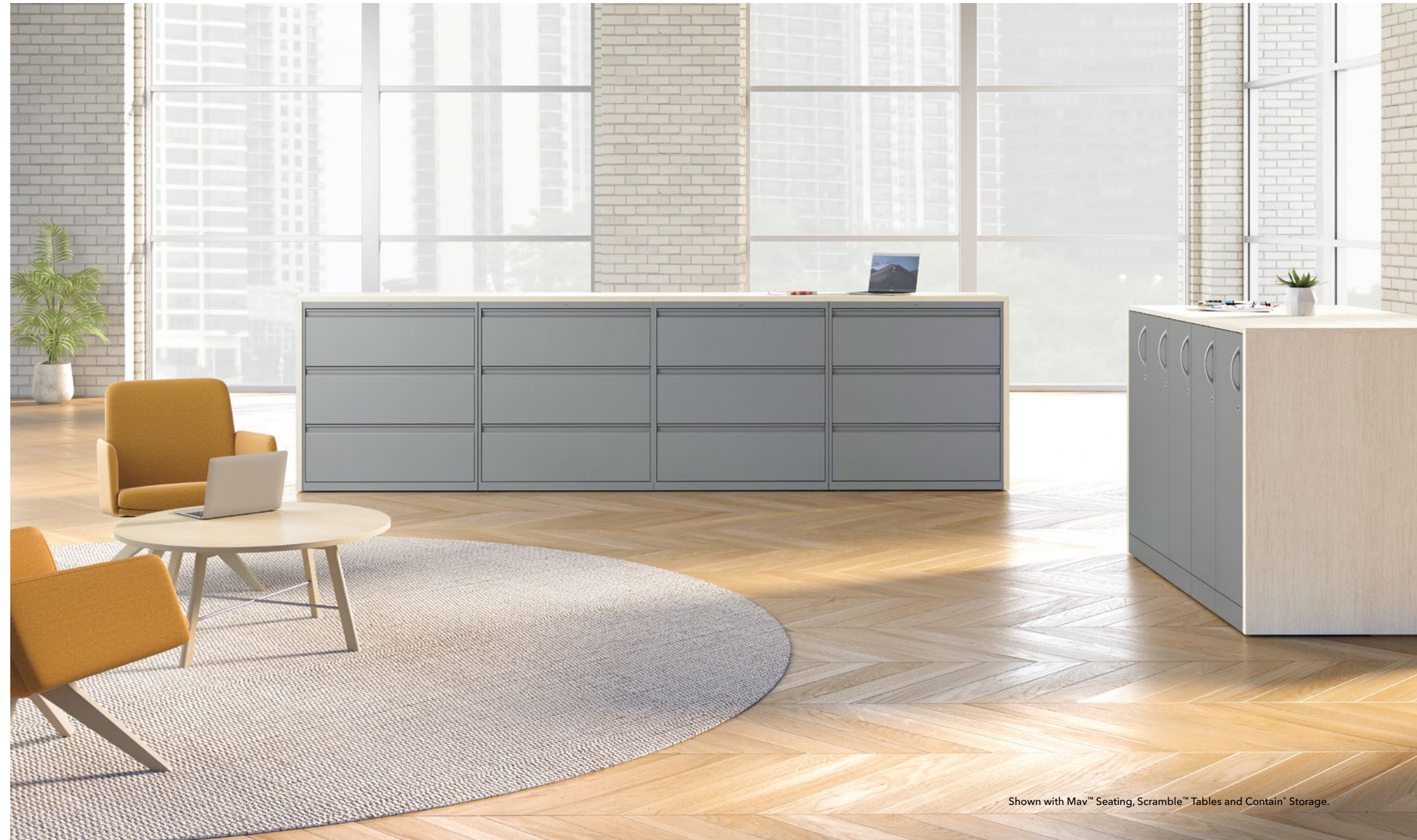
Shown with Mav™ Seating, Scramble™ Tables and Contain™ Storage.

Standard storage has its merits—general filing, simple organization, and maybe a place to stash an extra pair of sneakers. But why stay in the Stone Age if you’ve got the choice to evolve your current office organization into a dynamic, multifunctional hub? Designed to fit over existing storage to create dual purpose spaces, these practical and customizable laminate shells not only consolidate your work environment, they open the floor for meaningful collaboration, effortless connection, and seamless productivity. So, take a vacation away from office chaos—storage islands make it simple to enhance your organization, workflow, and aesthetic.