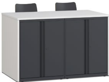
Compatible with Flagship® Storage