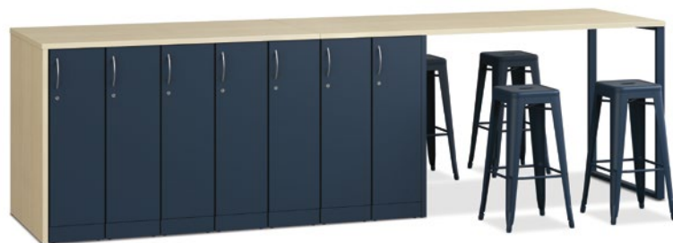
Compatible with Contain® Storage