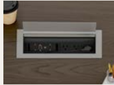
PRESIDE® Integrated Power Solution