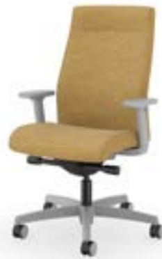
IGNITION® 2.0 Seating