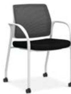
IGNITION® 2.0 Seating