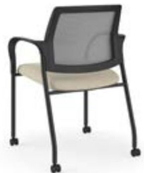
IGNITION® 2.0 Seating