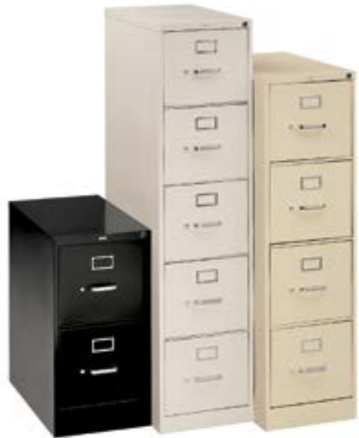
310 SERIES Vertical Files