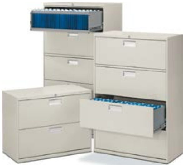
600 SERIES® Lateral Files