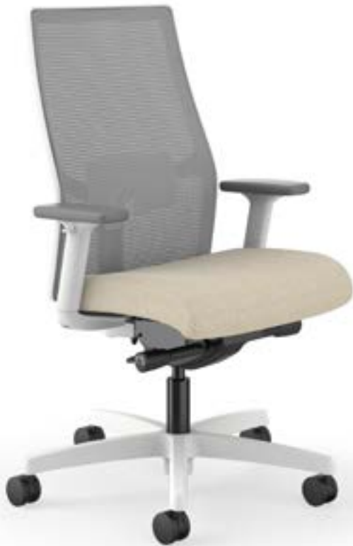
IGNITION® 2.0 Seating