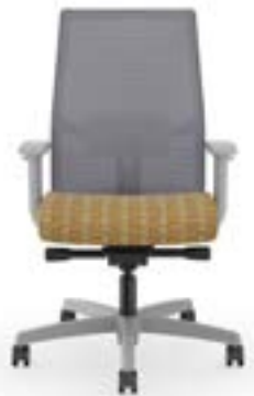
IGNITION® 2.0 Seating