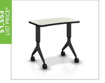
Motivate<sup>®</sup> Presentation Cart